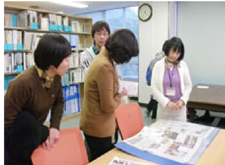
Kobe University Library Great Hanshin-Awaji Earthquake Disaster Materials Collection About 50,000items