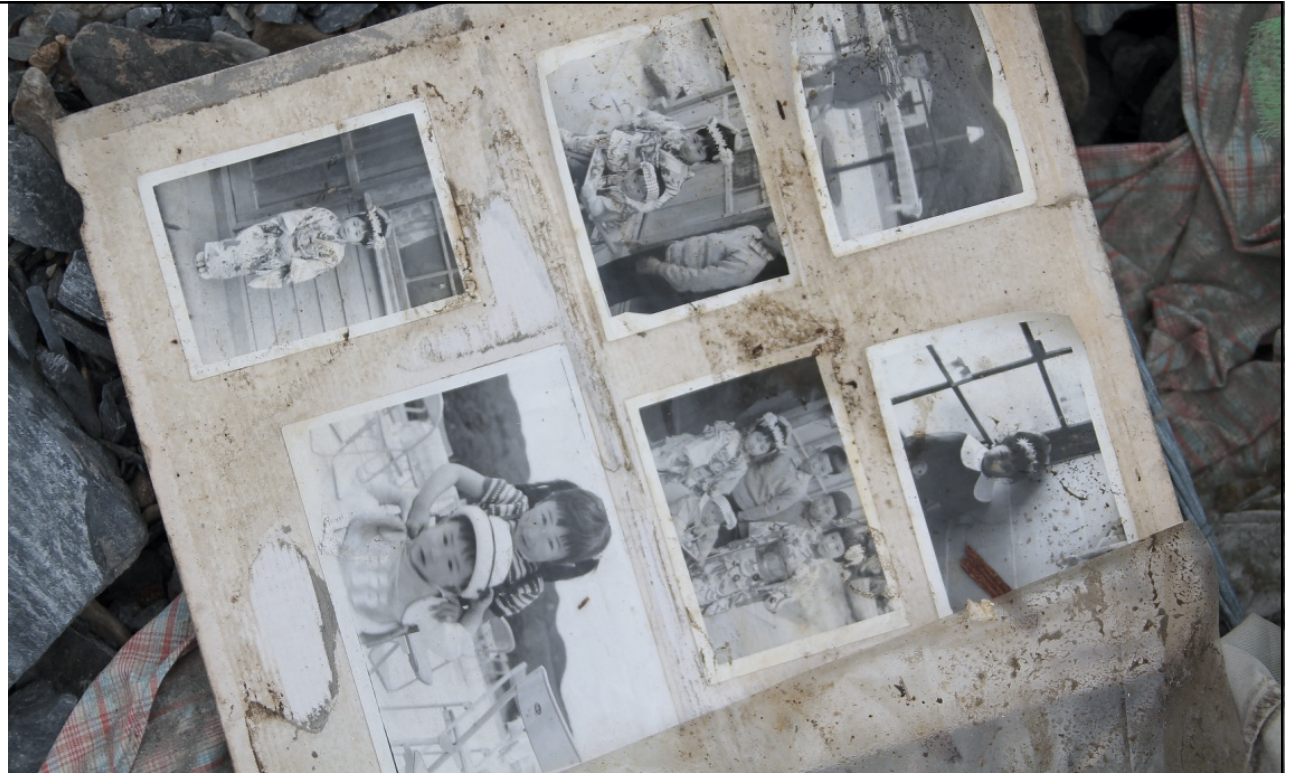
Left: June 28, Miyako, Iwate, Individual “memories” collected from the heap of rubble