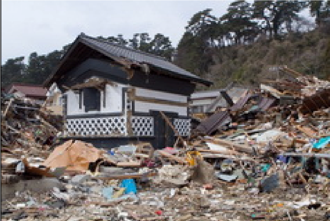
The damage just after Tsunami disaster of DOZO buildings, Japanese storehouse, in the Honma family in Ishinomaki City, Miyagi Prefecture