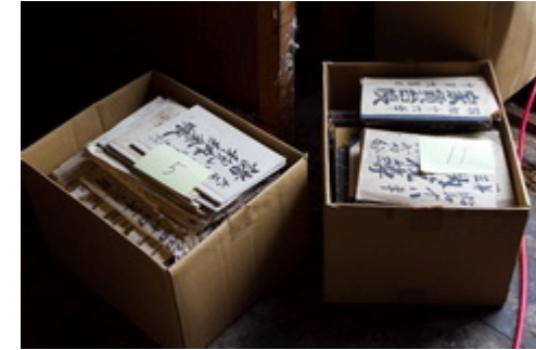
The archival box of Old Documents written in Sumi Ink ( Edo Era)