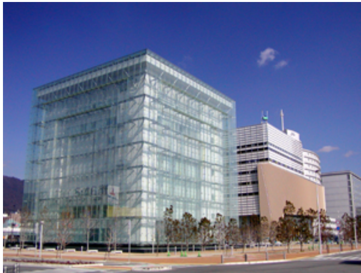
The Great Hanshin-Awaji Earthquake Memorial Disaster Reduction and Human Renovation Institution Library 150,000items