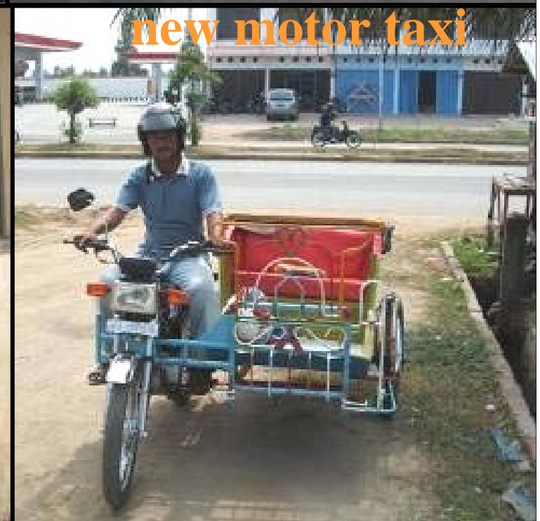
new motor taxi