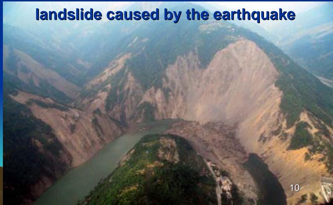
landslide caused by the earthquake