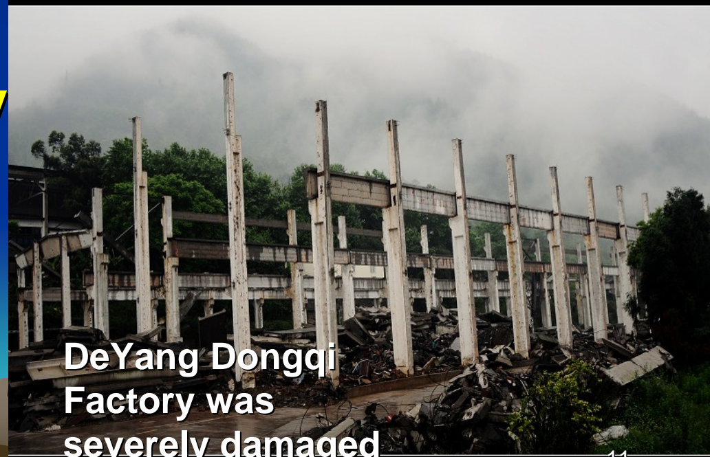
DeYang Dongqi Factory was severely damaged by the earthquake

Livestock and poultry losses reached 44.62 million.