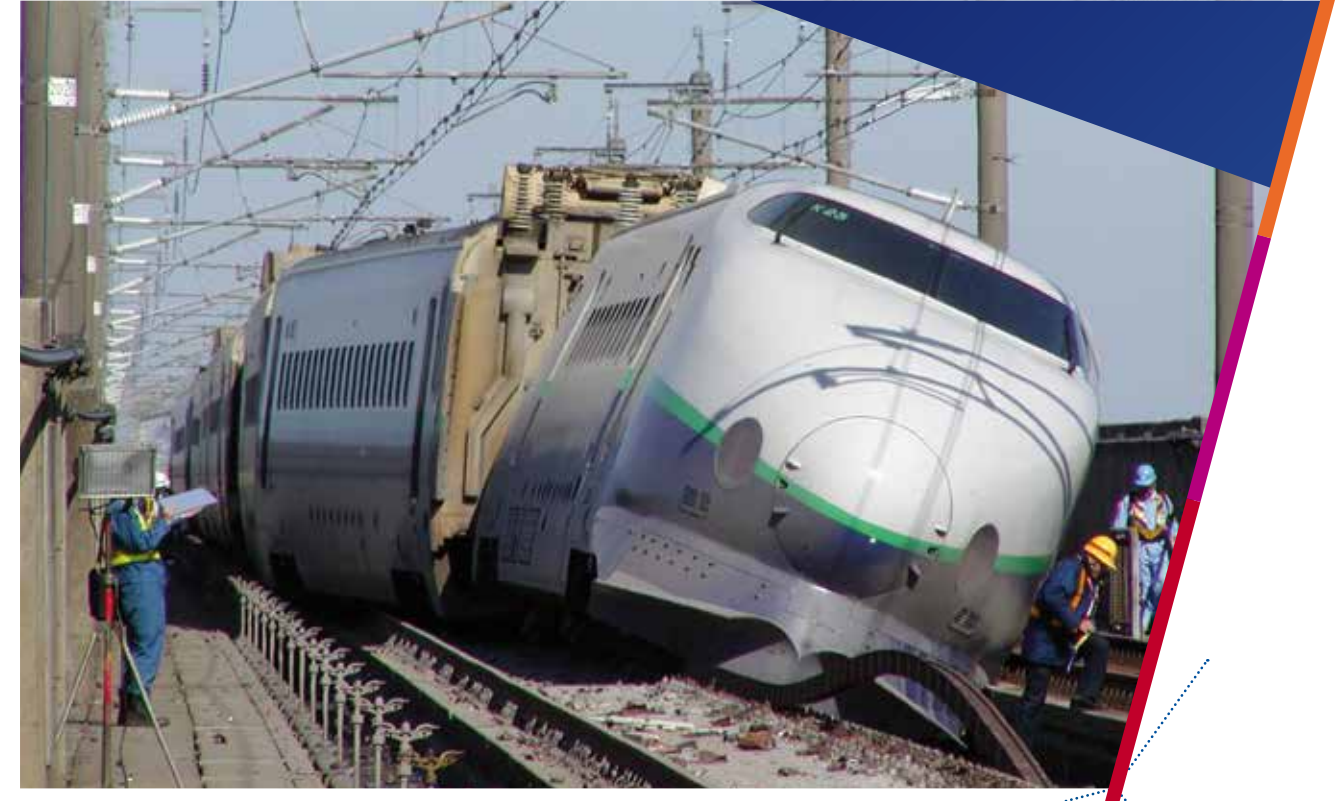
Image 1: A derailed Shinkansen bullet train, Niigata Prefecture, Japan, 2004.