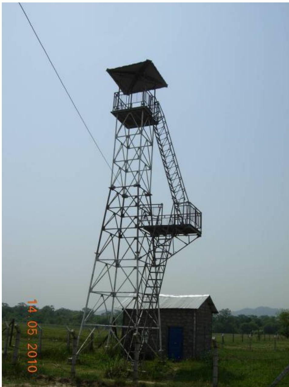
Early Warning Tower at Meghauri VDC, Chitwan