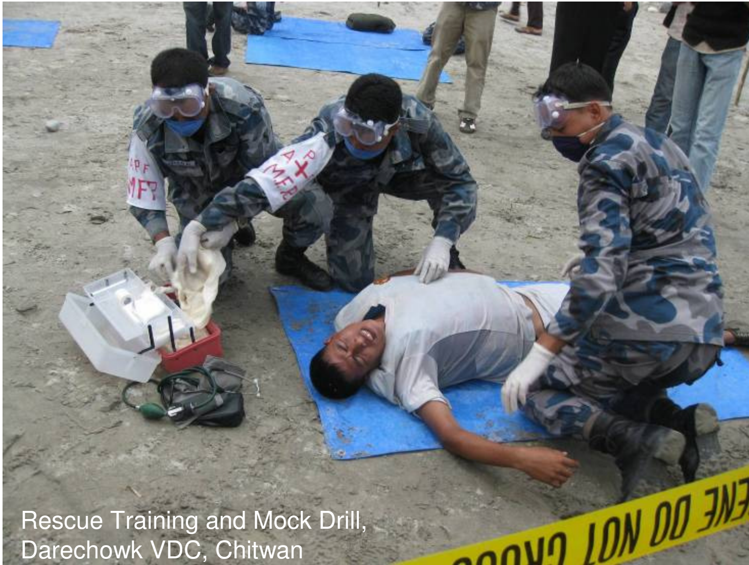
Rescue Training and Mock Drill, Darechowk VDC, Chitwan