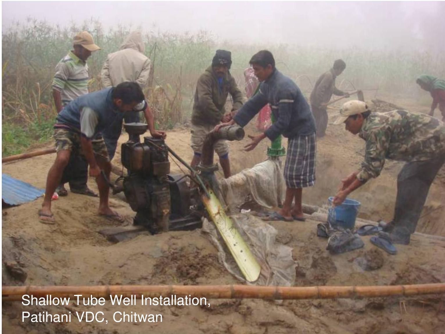
Shallow Tube Well Installation, Patihani VDC, Chitwan