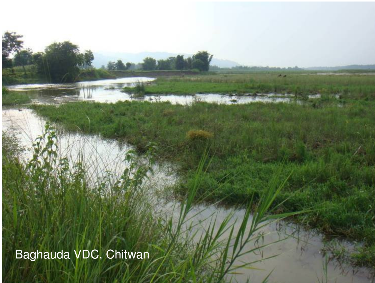
Baghauda VDC, Chitwan