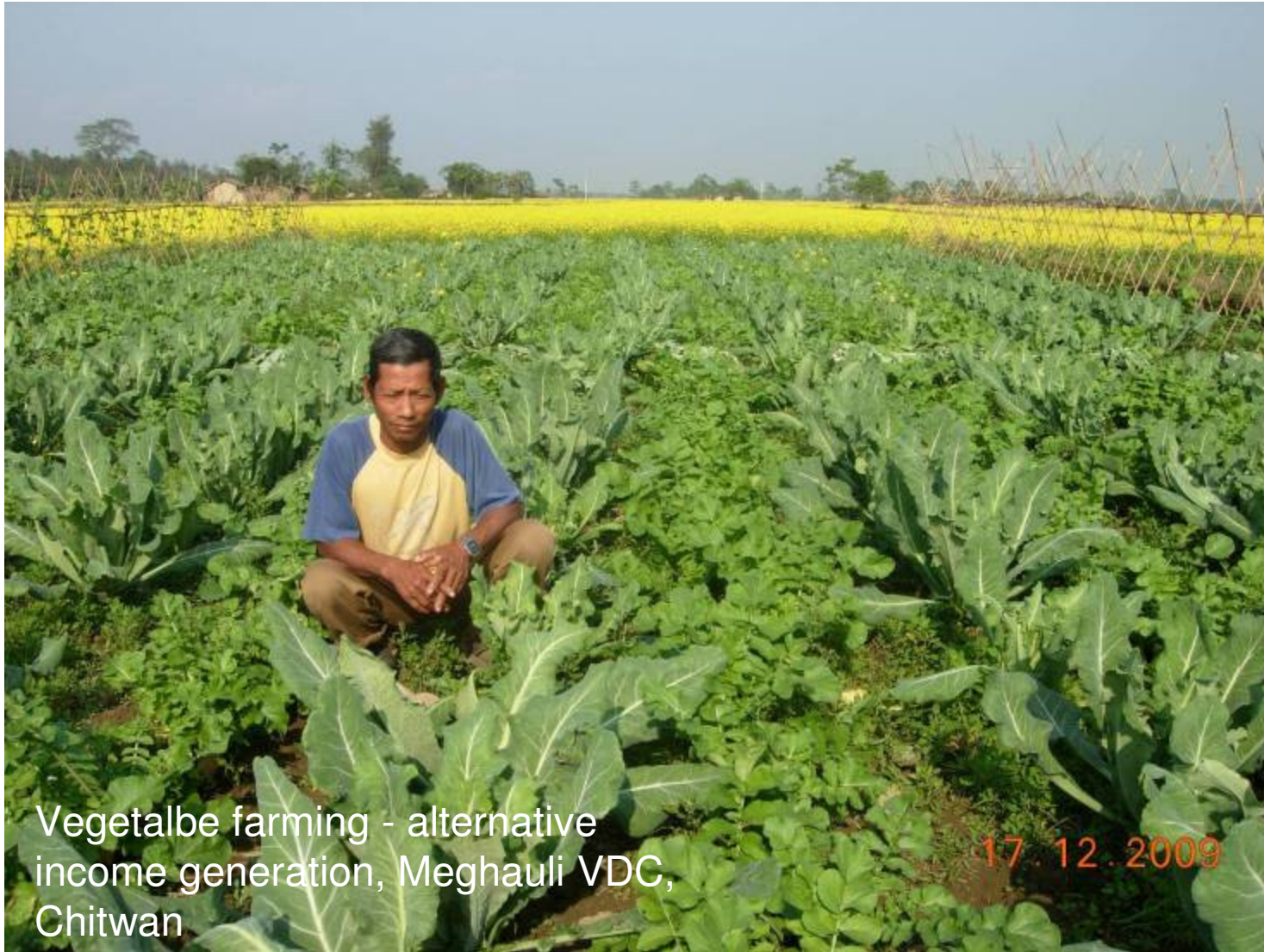
Vegetable farming - alternative income generation, Meghauri VDC, Chitwan