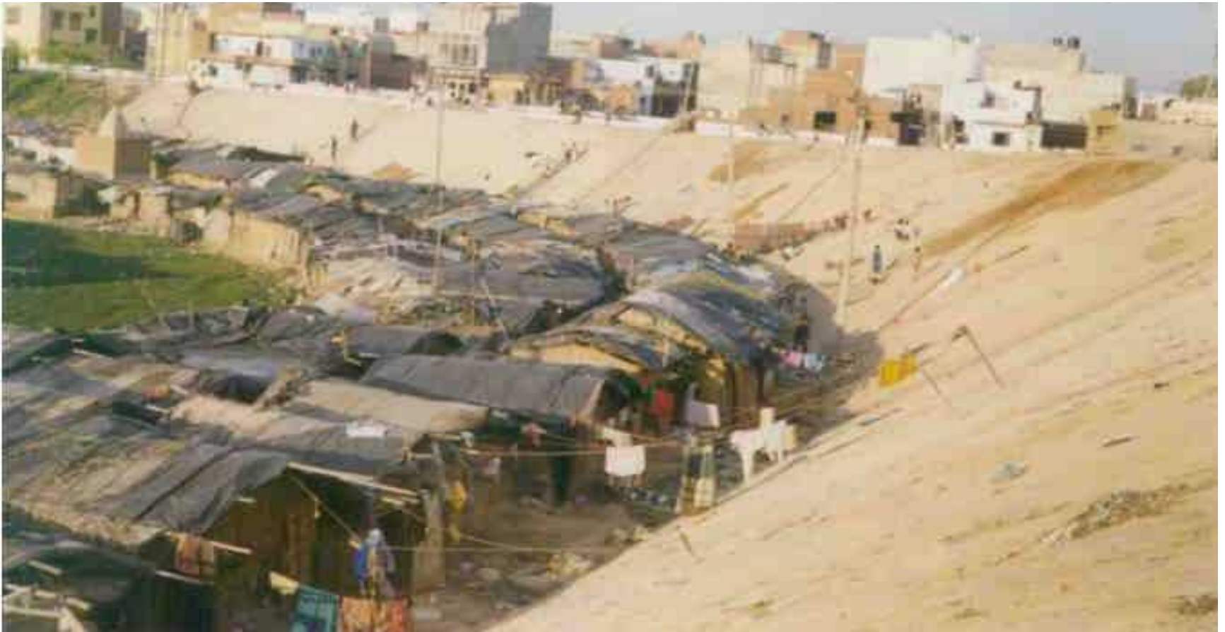
Living on the wrong side of the embankments

National Policies, Laws, Institutions are in place however, people continue to be at risk!