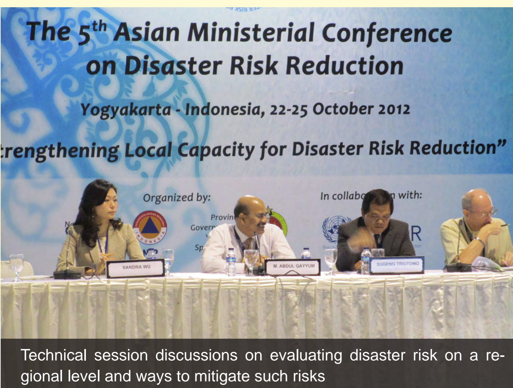
Technical session discussions on evaluating disaster risk on a regional level and ways to mitigate such risks

UNISDR holds regional DRR conferences bi-annually (on alternate years to the Global Platform) to promote disaster reduction in each region of the world. Kokusai Kogyo played an active role in the regional conference held in Yogyakarta, Indonesia in October 2012.