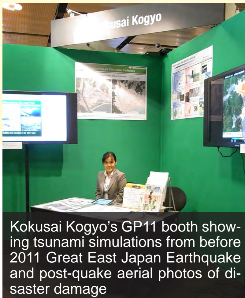
Kokusai Kogyo's GP11 booth showing tsunami simulations from before 2011 Great East Japan Earthquake and post-quake aerial photos of disaster damage

Kokusai Kogyo has been actively involved in the Global Platform since the one held in May 2011 (GP11).