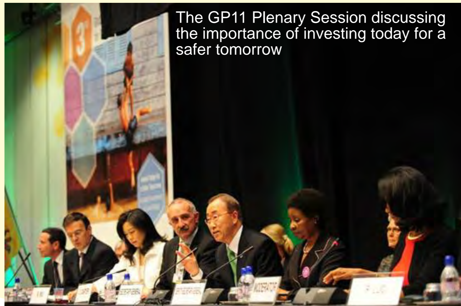
The GP11 Plenary Session discussing the importance of investing today for a safer tomorrow