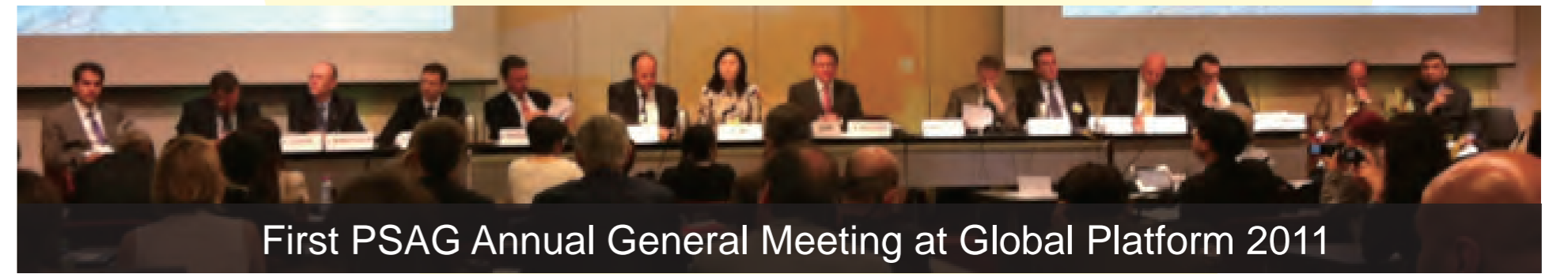
First PSAG Annual General Meeting at Global Platform 2011

In 2011 UNISDR, seeing the need for more active involvement of private sector companies in disaster risk reduction (DRR) and preparedness, established the PSAG to promote greater awareness of and active participation in DRR initiatives by the business community. Currently there are representatives of 18 companies from around the world active in the PSAG, and Kokusai Kogyo is the only Japanese company involved.