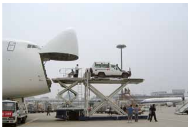
Loading of relief items / Schönefeld airport

Red Cross volunteers with suitable professional backgrounds are trained by the GRC in special ERU courses. These delegates are available for deployment on very short notice. The main focus of the GRC's emergency response is on health, water and sanitation, and shelter.