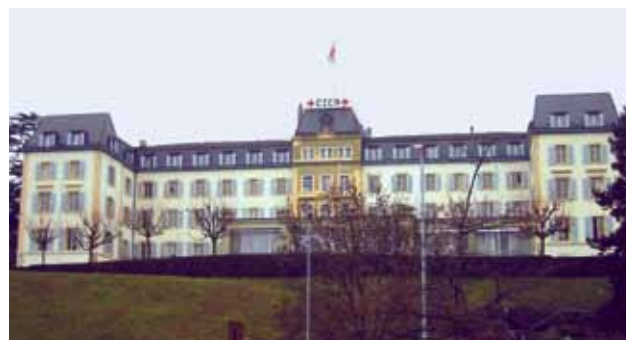
ICRC Headquarters in Geneva

The ICRC is an impartial, neutral and independent Swiss organization whose humanitarian mission is to ensure protection and assistance to victims of armed conflict or situations of internal strife. It safeguards the operation of the Central Tracing Agency as provided by the Geneva Conventions and carries out visits to prisoners of war and other detainees. The ICRC also endeavours to prevent suffering by promoting and strengthening international humanitarian law and universal humanitarian principles. The ICRC headquarters is situated in Geneva. www.icrc.org