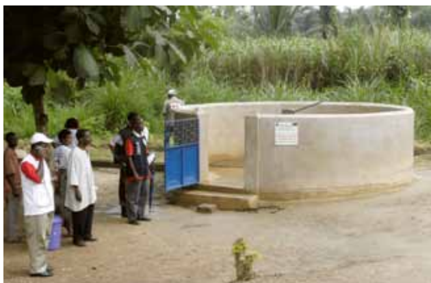
Water Facility, Togo

Water/Sanitation and Hygiene projects contribute to the "Global Water and Sanitation Initiative" (GWSI) of the International Federation. They follow the same integrated movement approach focused on community participation, sensitization and hygiene education to secure the sustainability of all water and hygiene related infrastructure they deliver.