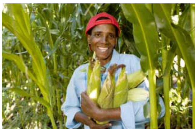
Livelihood project, Lesotho

the access to agricultural inputs and to sales markets. In addition, the GRC supports various individual projects aimed at generating incomes (IG projects) that target specific groups like women, people living with HIV/AIDS, families hit by disasters, and landmine victims. To improve opportunities for youth, the GRC has projects which support social and educational activities.