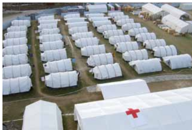
Base camp, Haiti

http://www.drk.de/weltweit/katastrophenhilfe.htm