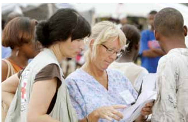
Delegates in Haiti

The GRC often assigns delegates to projects such as those described above. The main focus of our recruitment policy is to bring the best possible service to the beneficiaries in need of assistance and to support and train staff and volunteers of partner National Societies.