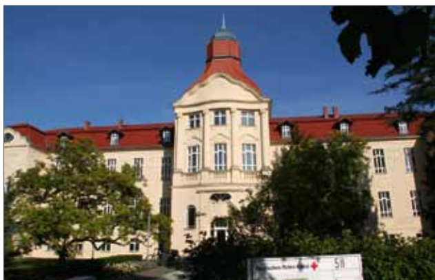
GRC Headquarters, Berlin