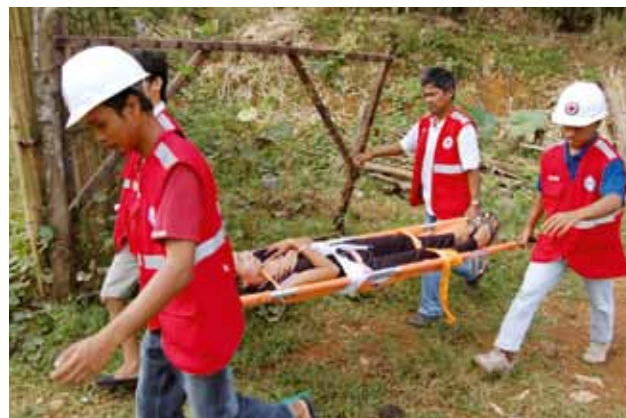
Rescue team training, Philippines

Disaster Risk Reduction and Climate Change Adaptation projects focus on community based risk assessments and the development of community capacities to mitigate disaster risks. They also address on the risks that climate change may pose to communities in terms of future disasters. The second focus lies with capacity building for our partner National Societies; to strengthen competencies for risk reduction with aim to reduce future needs of emergency intervention.