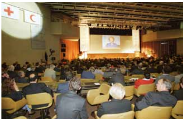
The International Conference

The bodies that govern the Movement are the International Conference of the Red Cross and Red Crescent, the Council of Delegates and the Standing Commission.