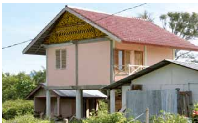
Flood adapted housing, Indonesia

Once an acute emergency situation is over, the GRC often takes part in rehabilitation projects which help to rebuild infrastructure such as destroyed houses, medical facilities and schools. Community participation is the norm when such projects are implemented. This ensures that the assistance delivered to beneficiaries will correspond to their needs, which is an important precondition for sustainability. Whenever possible, these projects include activities designed to strengthen the disaster management and risk reduction capacities of the population and the partner National Society on site. Based on local risk analysis,