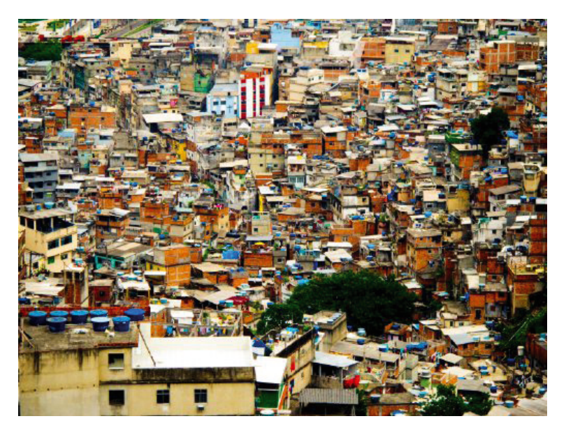
View of the favela Rocinha in Rio

Legislation and disaster risk reduction at the community level