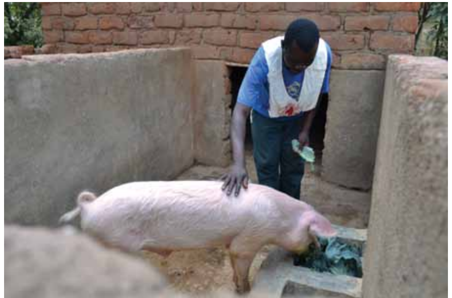
Vegetable and maize growers provide feed to the animal husbandry farmers.