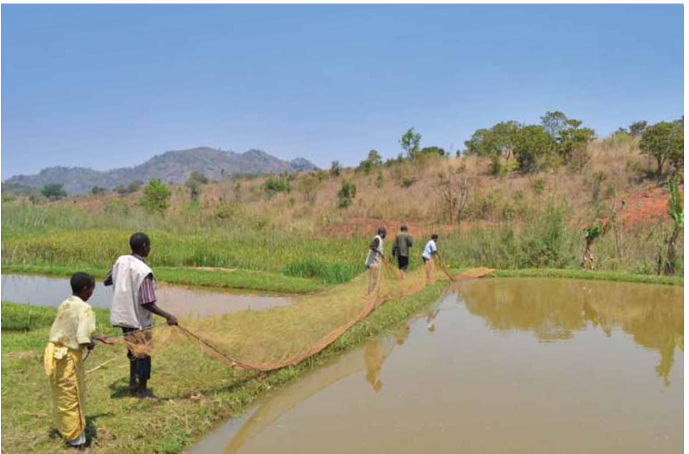
Fish ponds in Malawi. The harvested fish are shared among members and the surplus is sold to raise cash.