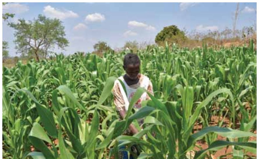
Women's involvement has been key to the success of the projects.