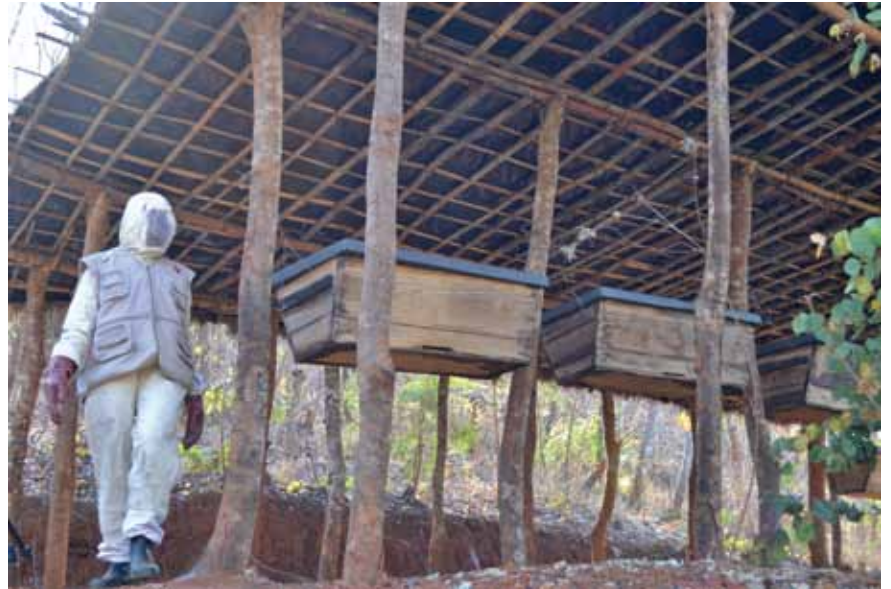
The bee project is a source of income for Malawi Red Cross Society farmers.