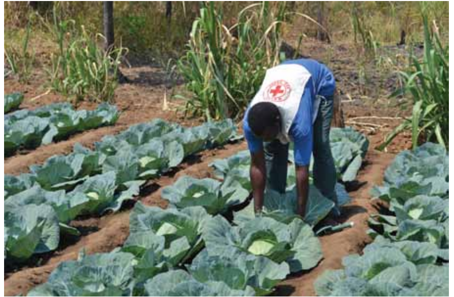
Increasing food availability and access in Malawi.

farmers can economically trade and exchange produce. The first phase of the projects starts with the provision of a start-up agricultural input package which includes a range of items such as appropriate seeds, goats and pigs, tools, irrigation equipment, fertilisers and chemicals. This is combined with community-based education on small-scale irrigation, soil and water conservation. Following these lessons, community and family-based fishery ponds and gravity powered irrigation schemes have been built with the help of the Malawi Red Cross Society. During the second phase, communities with the facilitation of the Red Cross share knowledge on nutrition, balanced diet and ways of food preservation and processing. Linked to this, are community-based seed/grain banks and promotion of vegetable gardens and fruit tree seedlings. Through such initiatives communities learn how to preserve seeds and vegetables from their harvest for future use. The third phase is interconnected to phase one and two. Families and communities involved in animal husbandry and fishery projects depend on grain and vegetable growers to supplement their