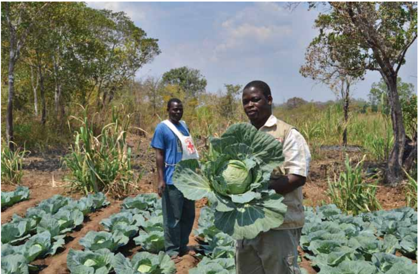
Vegetables from Red Cross gardens are used for family food or sold at local markets.

Malawi experienced very high inflation and fuel and foreign currency shortages which affected programme implementation in the last two years. Prices of farming inputs kept escalating and affected the budgets. In order to minimize disruption, the Malawi Red Cross Society, where possible, procured some of the requirements in abundance from local markets near the projects to cut on fuel costs. These challenges also caused delays in the disbursement of funds, and some activities were postponed. The success of the project has attracted more people, particularly those affected by droughts.