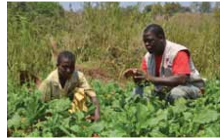
Malawi Red Cross Society staff provides technical support to farmers.