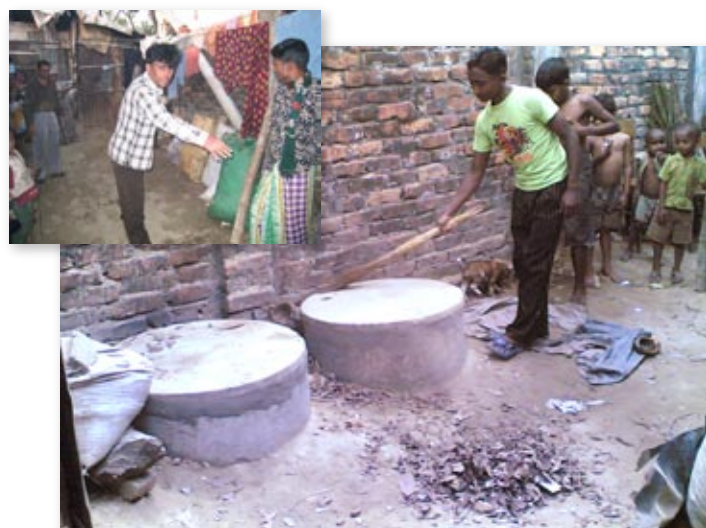
Before and after the toilet construction in Chawk Bazar.

After the identification and formation of WDMC and CAs, training on CBDRM was conducted at ward level to build the capacity of these representatives to conduct the participatory vulnerability and capacity assessment in each of the vulnerable wards. The main purpose of this training was to develop the skills and knowledge of the selected change agents to enable them assessing community's vulnerabilities and capacities and preparing community level action plan. The training was held on 14-16 March 2007 at Karnaphuli HRDI UTSA training center, Chittagong. This training was attended by 30 change agents, selected from 10 wards of CCC. This training focused on: concepts of hydro-meteorological hazards and urban disaster; concepts of urban disaster risk management; and participatory hazard and vulnerability mapping and tools. It brought out cross-cutting issues (gender, environment and health), and arranged for a field visit to PROMISE wards.