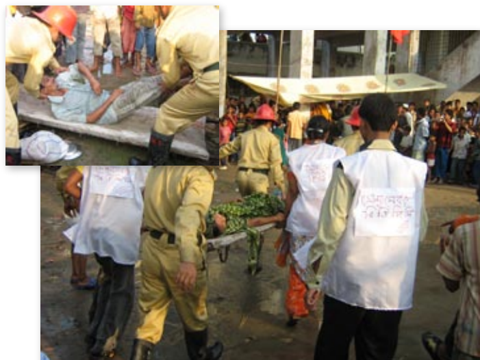
Mock drill of the community

to the Medical College Hospital and took part in providing first aid to the injured persons. The CAs of ward 26, ward 37 and ward 40 collected dry foods, drinking water, clothes and distributed those to survivors. They protected the ponds used for the purpose of fisheries by netting the four banks of the ponds and thereby stopping the fish from escaping.