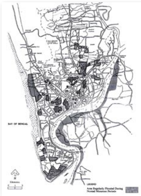
Flood map of Chittagong

Chittagong has a historical profile related to hydro-meteorological hazards such as floods, earthquakes, cyclones, landslides and