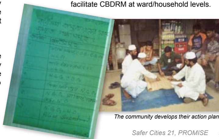
The community develops their action plan.

To support the WDMCs, groups of volunteers called change agents (CAs) were identified and trained in emergency response. The main roles and responsibilities of the change agent were to keep the WDMC members well-informed on relevant developments, and facilitate CBDRM at ward/household levels.