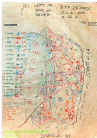
Community risk map of Ward 26

When a hazard occurs, elements at risk (such as people, crops, buildings and services) may be lost, damaged or disrupted. These elements are normally identified after a disaster has happened in a 'damage and needs assessment'. The action taken is to distribute relief items to meet immediate needs. This action does not address the reasons why the disaster happened. The affected community could therefore be hit by another disaster in the future when the same or a different hazard strikes.