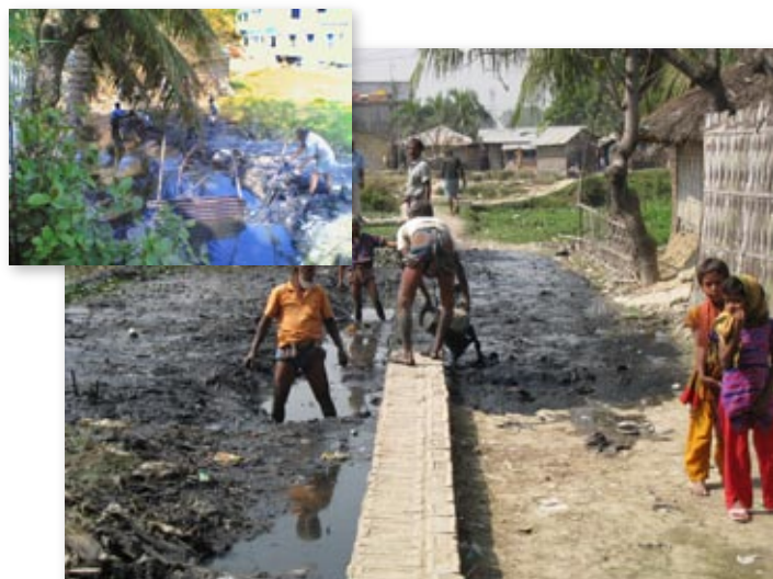
Before and after the canal re-excavation in North Potenga

Monitoring measures and follow-up actions were instituted at the community level to sustain the projects for the long-term impacts and benefits. In Chawk Bazar, the beneficiaries would deposit 10 BDT (USD 0.15) per household to maintain the water and sanitation facilities. The households near the canal in North Potenga have taken up the responsibility to monitor if anyone should throw the garbage into the canal, and make a report to the WDMC. The poor community of South Potenga decided to protect the pond filter water