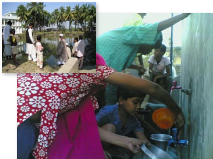
Before and after pond filter for South Potenga; drinking the filtered water

North Potenga has CBOs that got involved: Ekta, a formal organization for promoting social and cultural spirits; Ashok Club, a group of volunteers, and World Vision Bangladesh. Ashok Club and World Vision Bangladesh provide free safe drinking water to the poor communities during crisis situations. CBDRM mobilized both of these institutions to participate for the benefit of the community. The leader of Ekta also represents the WDMC, and actively participated in the whole process of project formulation and motivated other community members to realize the problem. CBO involvement has given the