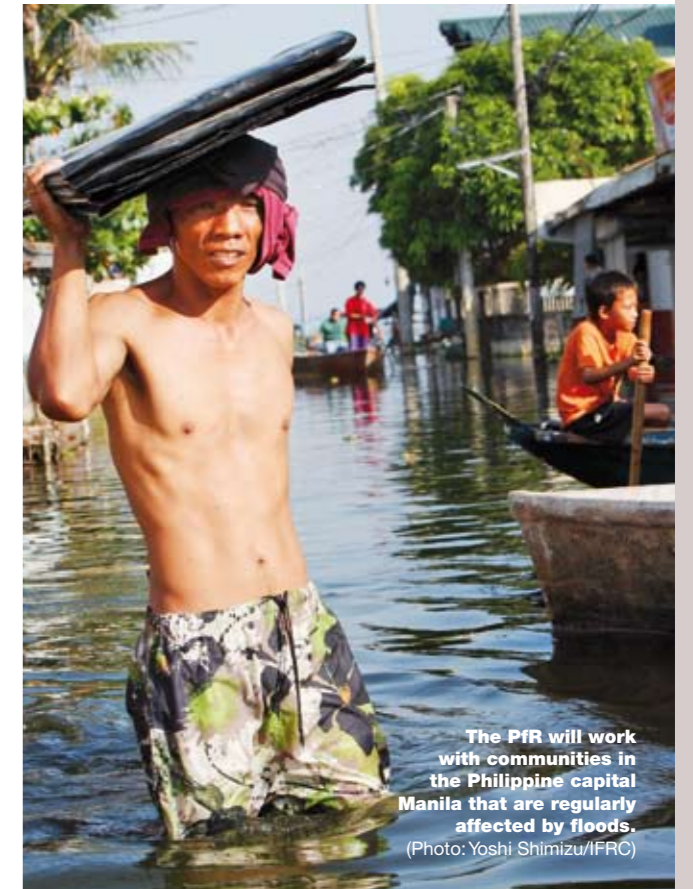
The PFR will work with communities in the Philippine capital Manila that are regularly affected by floods.

To improve this situation, five Netherlands-based humanitarian, development and environmental organizations, with support from the Dutch Ministry of Foreign Affairs, have formed an alliance to reduce the impact of hazards on vulnerable communities. They are the Netherlands Red Cross, the Red Cross Red Crescent Climate Centre, CARE Nederland, Cordaid, and Wetlands International: the "Partners for Resilience" (PFR).