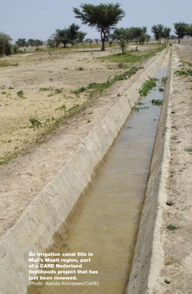
An irrigation canal fills in Mali's Mopti region, part of a CARE Nederland livelihoods project that has just been renewed.

"But PFR is the first chance we've had to fully integrate environmental work in areas like river basin management with humanitarian risk-reduction."