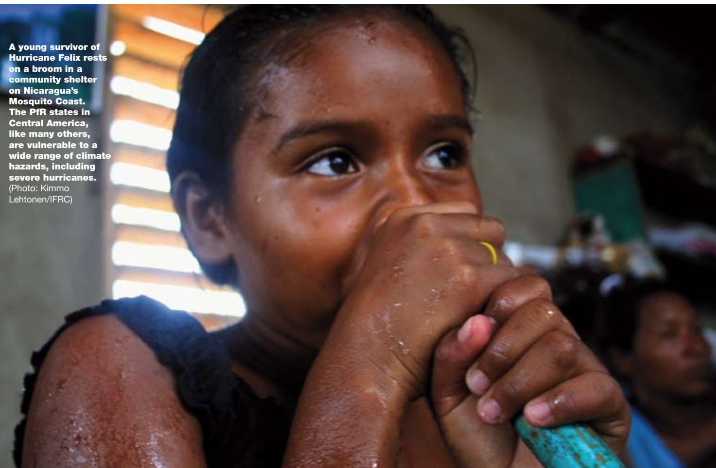
A young survivor of Hurricane Felix rests on a broom in a community shelter on Nicaragua’s Mosquito Coast. The PfR states in Central America, like many others, are vulnerable to a wide range of climate hazards, including severe hurricanes.

Examples of possible strategies for communities, supported by the PfR programme, are building shelters, planting trees, establishing disaster-response committees. The PfR will also work with the local authorities to ensure sound policies and plans are put in place, like sustainable water-management and coastal defence.