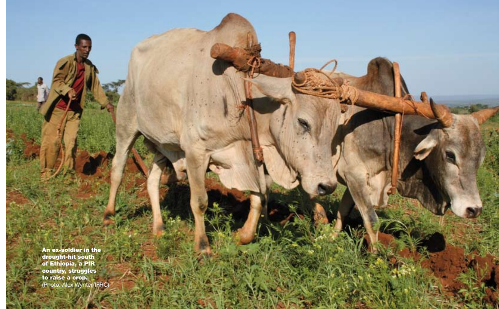
An ex-soldier in the drought-hit south of Ethiopia, a PfR country, struggles to raise a crop.

In concrete terms, the PfR will work with communities to determine the main disaster risks they face, and many local partners have already been recruited. Community-managed projects will enhance the security of livelihoods by, for example, making houses more disaster-resistant and protecting arable land against damage from natural hazards; agricultural and pastoralist techniques will be improved; robust water-supply systems will be