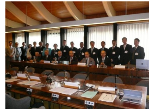
1 st IPRED meeting, Paris, 2008