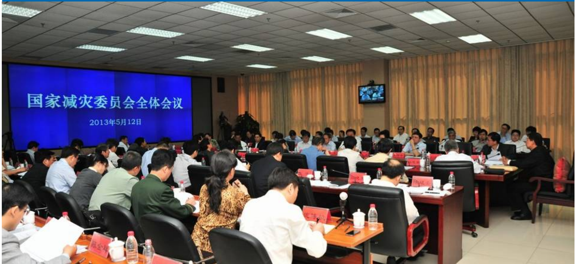
The Plenary of China National Commission for Disaster Reduction on 12 May 2013