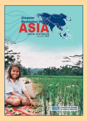
Cover Photo: East Timorese girl selling vegetables at the local market in Baucau

Disaster Reduction in Asia ISDR Informs is a collaborative effort of the United Nations Inter Agency Secretariat for the International Strategy for Disaster Reduction (UN/ISDR), the Asian Disaster Preparedness Center (ADPC) and the Asian Disaster Reduction Center (ADRC).