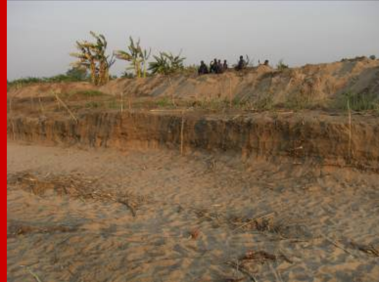
River de-silting in Malawi; a community activity inline with PVA community action plan