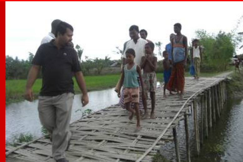
A low cost bridge built to ease access to school in Bangladesh