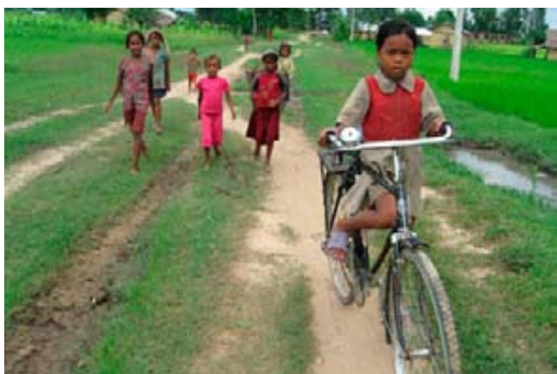
Children take muddy roads to school in Bageshwari, Banke, Nepal

Poor road networks and limited transportation facilities make transporting goods to market or reaching schools and hospitals extremely difficult, especially during floods and landslides.