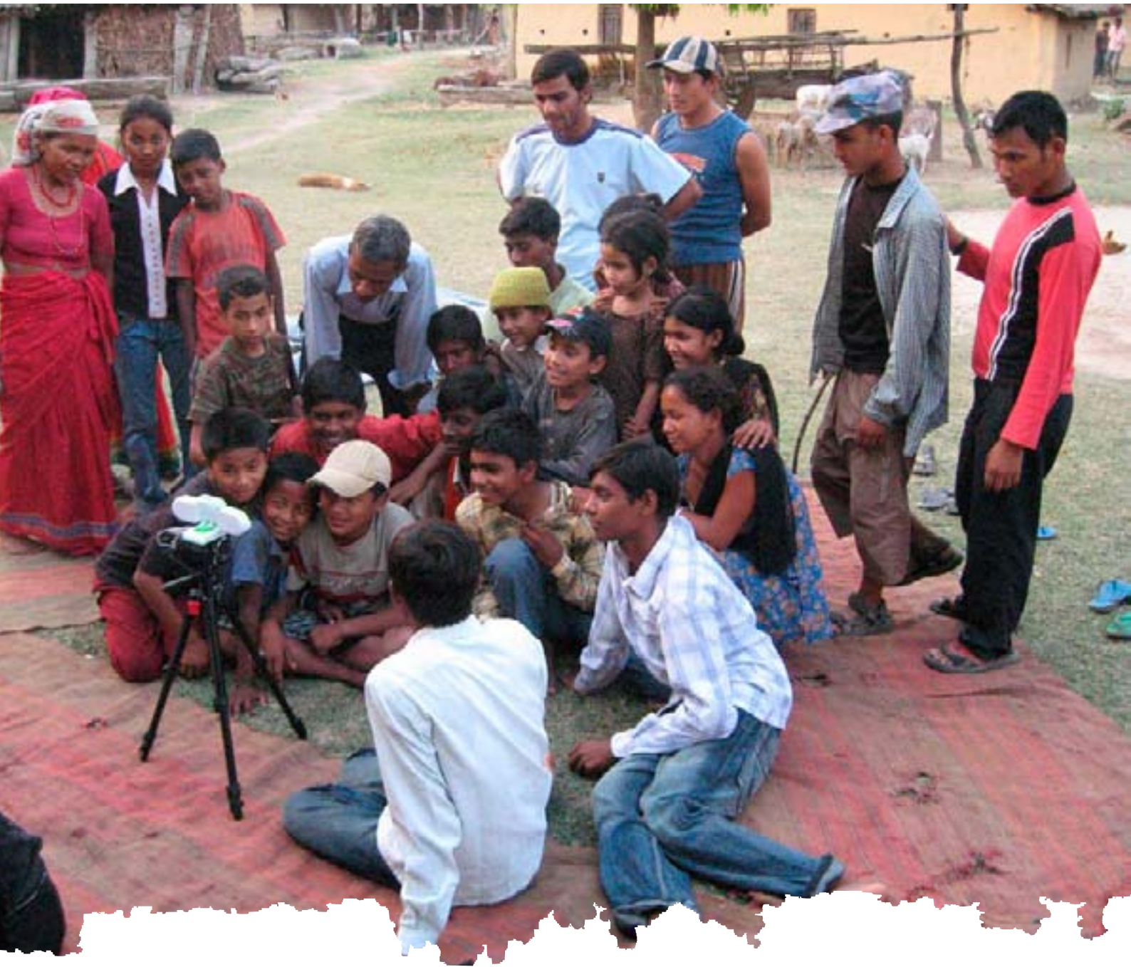
Children learn about the climate change project and see themselves on the camera for the first time in Matehiya, Banke, Nepal