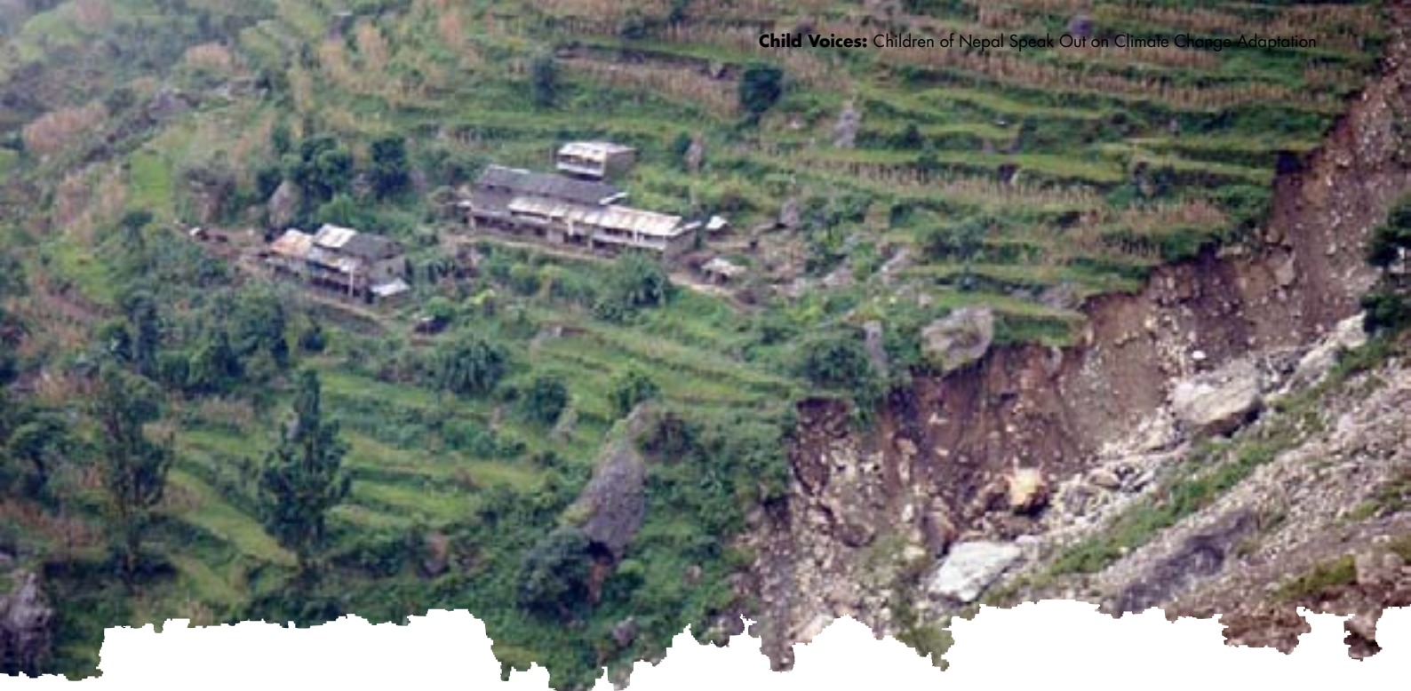
Landslides destroy homes, roads and cropland near Ramche, Rasuwa, Nepal