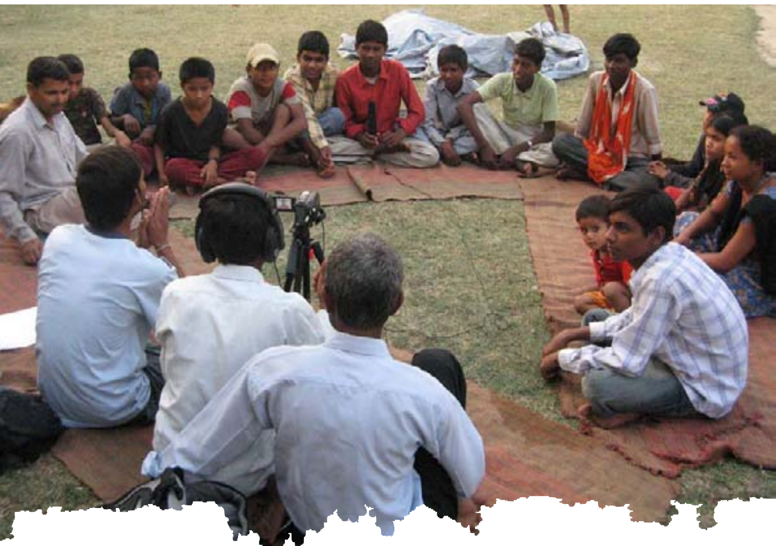
Children learn about the participatory video climate change project in Matehiya, Banke, Nepal

“We cannot escape climate change, but we need to reduce its effect on people, livestock and crops.”