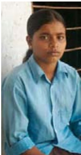
Box 1: Metehiya case study