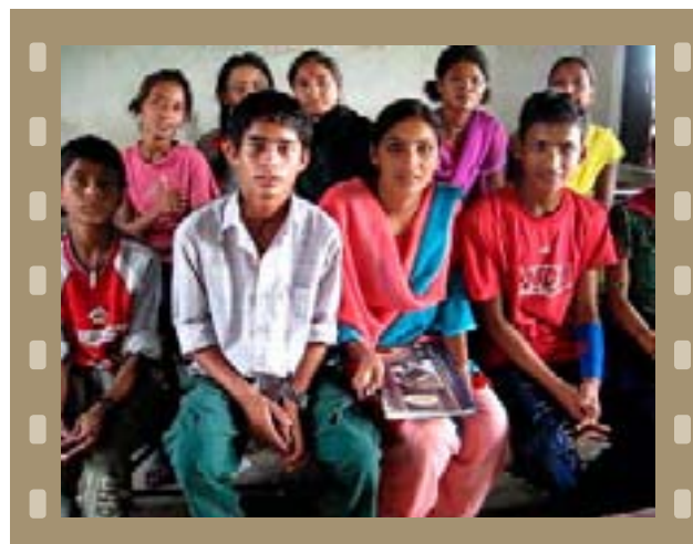
Children who participated in the participatory video climate change project in Bageshwari, Banke Nepal