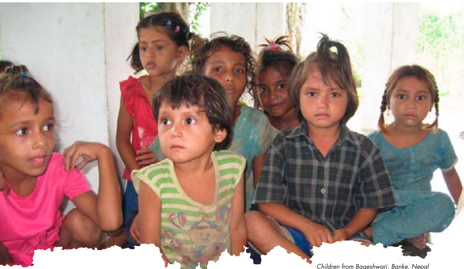
Children from Bageshwari, Banke, Nepal