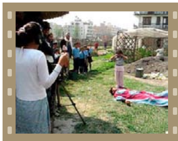
A young girl cries at the loss of her brother due to flooding (image from the children's participatory video drama in Balaju, Kathmandu)

In Banke district, the children talked about their family members suffering from sleep disturbances, stress, irritability and a lack of concentration after floods. It is common to find anxiety and depression in elderly people and children more than six months after a flood due to multiple associated problems. 16 The emotional impact of extreme weather-related hazards, including dealing with the loss of loved ones, was one theme explored in several of the participatory videos made by the children.