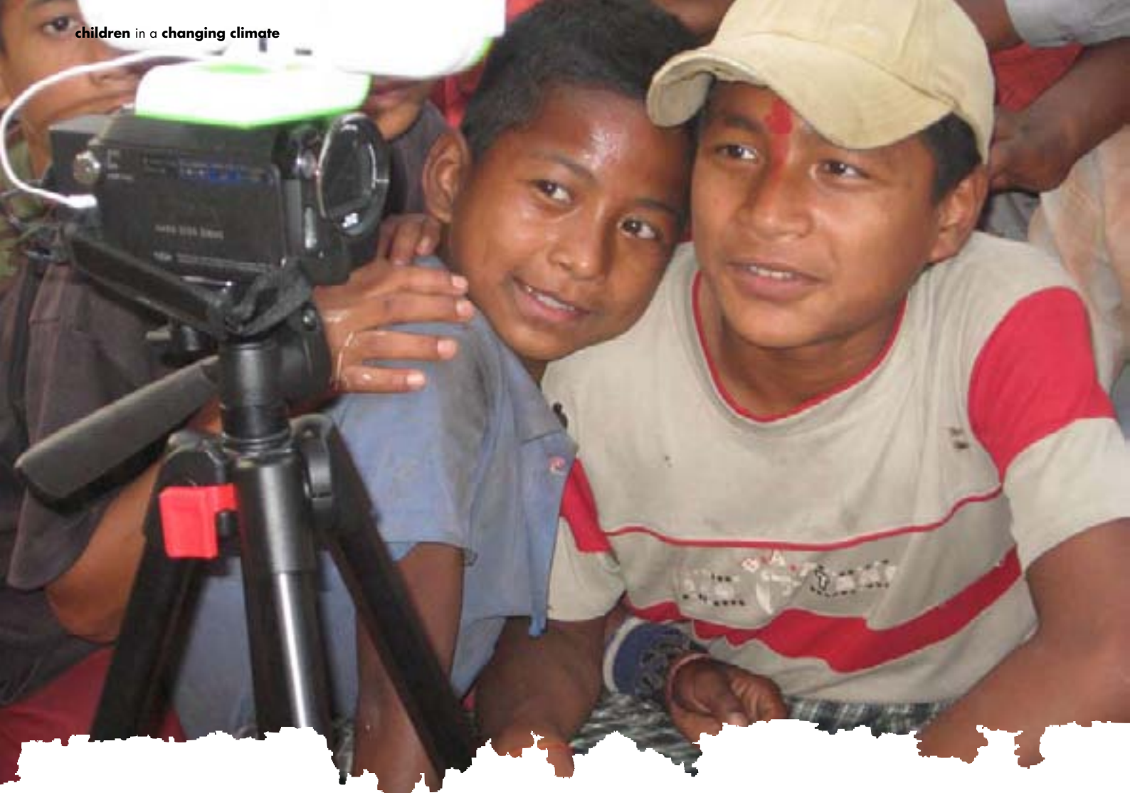
Children see themselves in video for the first time in Matehiya, Banke, Nepal