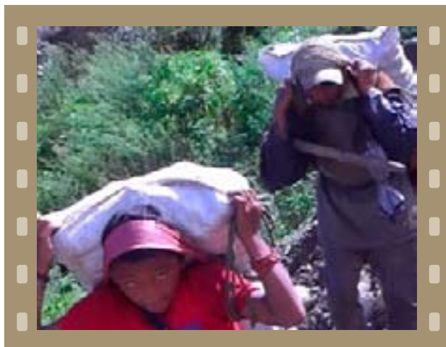
Young boys often work as porters during school breaks to support their families (image from the children's participatory video drama in Ramche, Rasuwa, Nepal)

Seasonal migration to urban areas and abroad for work is an increasingly common livelihood diversification strategy. Remittances have become an important source of income in the rural areas, especially when crops fail and agricultural incomes fall.