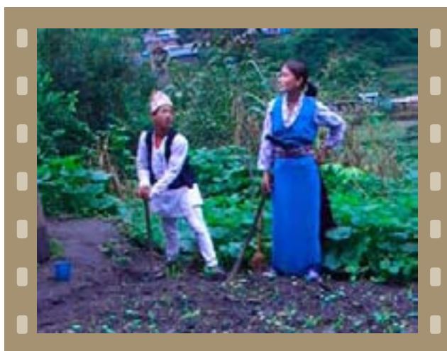
A father and wife labour on their farm hoping for good weather (image from the children's participatory video drama in Sybru Besi, Rasuwa, Nepal)

In Bageshwari, some women's groups have started cultivating improved varieties of grass like Napier and NB-21.