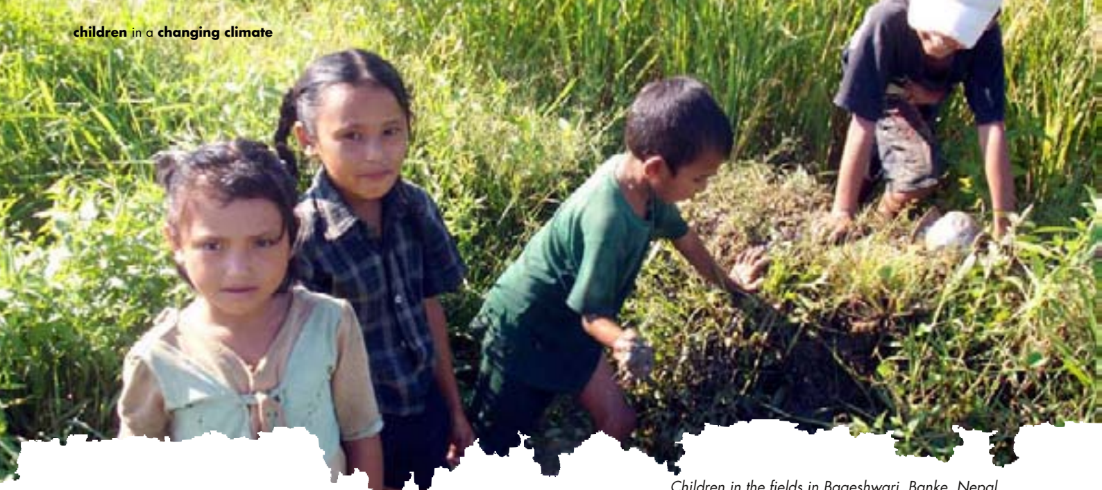
Children in the fields in Bageshwari, Banke, Nepal