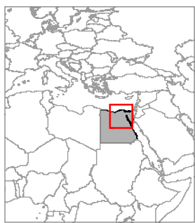
Population Density within and outside of a 10 meter low elevation coastal zone (LECZ), 2000