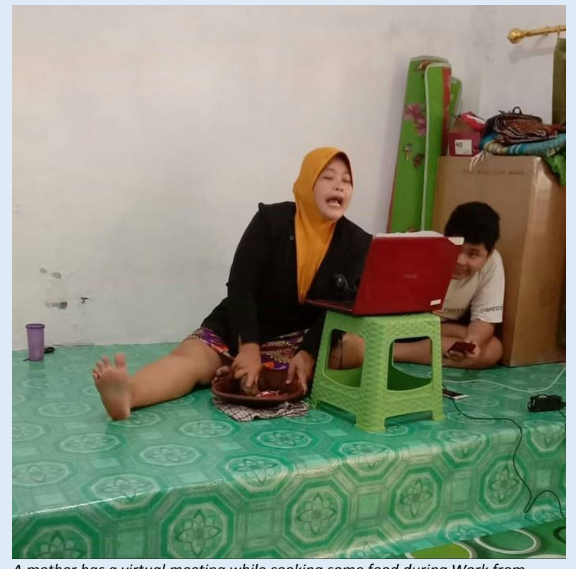
A mother has a virtual meeting while cooking some food during Work from Home (WFH) regulation.

Decree No. 7/ 2020 and No 9/2020 about Covid-19 Task Forces, have limited women inclusion which is not aligned with Head of National Management Disaster Agency Regulation No. 13/2014 about Mainstreaming Gender in Disaster Management. The Ministry of Woman Empowerment and Child Protection as representative of women and children was not included as a task force member3. The most influential task force members who appear daily in media to announce the update of Covid-19 are both men. A female doctor was appointed as additional later spokesperson on the third month to announce the daily update of Covid-19 along with the previous spokesman.