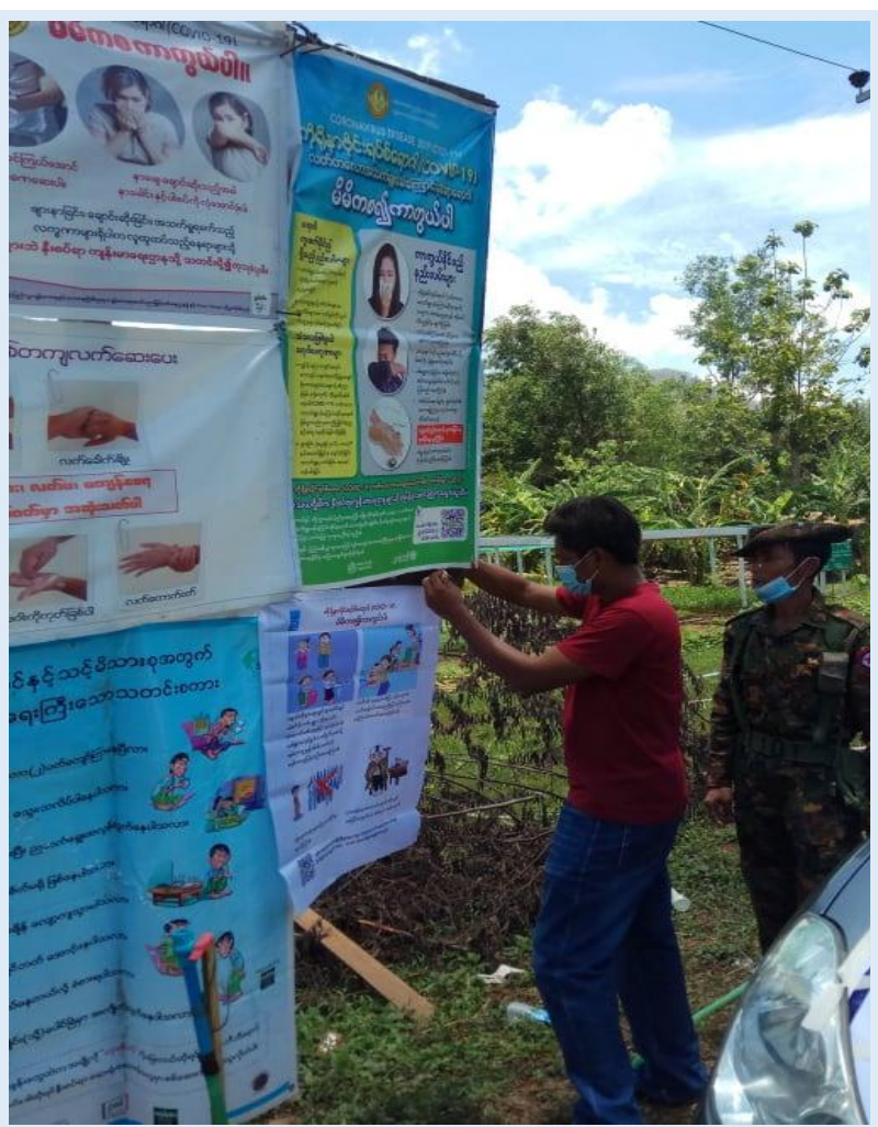
CSO members raising posters for COVID-19 at the center points together with military personnel.

The Civil Society Organizations also played a big role in this by providing their service as volunteers, raising awareness of the disease among the people through distribution of reading materials, using loud speakers and hand held speakers, posters and hand washing centers. Besides, showing the methods of making liquid soap, hand sanitizers by using available materials and making woven cloth masks. These demonstrations were taken in videos and distributed as widely as possible. At the same time, they developed guidelines for Based Community Facility Quarantine and Community Based Surveillance Guidelines and distributed them to at-risk