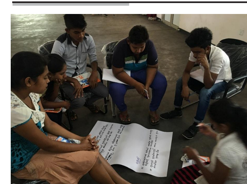
National C&Y consultation, 2018: Sri Lanka.

climate change (AF 2020). This has been attributed to the lack of ability of the youth to provide concrete inputs to the climate change debate. While this could indeed be a question of the need for change in perceptions and behaviors it also points out to the accelerated need for investing in capacity building for the youth. This is especially true of the developing countries across the world which harbors a large percentage of today's youth.