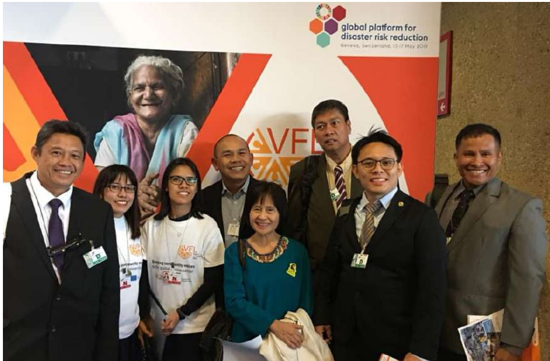
Global Platform for Disaster Risk Reduction, Geneva, May 13–17, 2019.