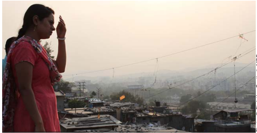
Dhage Deepa looks over the Janata Vasahat slum on the Parvati Hills. It is located on a steep slope. Each monsoon season triggers grave landslides that often sweep whole houses away.

Analyses carried out by the United Nations show that women are disproportionately impacted by disasters. The reasons are many and varied. They often have less access to education, they often take care of the household, and consequently are sometimes less mobile than men. Women are therefore often