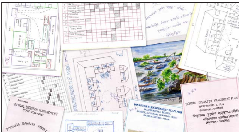
From concept to action: 915 SDMPs prepared by educators between IDDR 2016 and IDRR 2017.

During the IDDR 2016 celebration, AIDMI announced to link each school safety training with the preparation of School Disaster Management Plan (SDMP) by trained educators. The commitment resulted into 915 SDMPs that were prepared by educators themselves based on the training lessons. Various agencies joined this year-long action - state and district disaster management authorities; UN agencies, city municipal corporation; and 1471 schools. The SDMP is becoming a tool to prepare a plan at school level as well as connecting