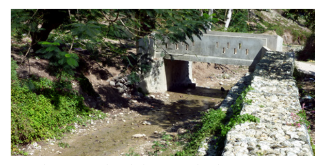
Structural river protection (Terre des hommes Foundation)

Download the report: "Évaluation post-Matthew de l'efficacité GRD" (in French only).