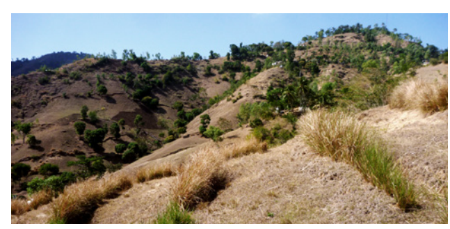
Contour planting with Vetiver to prevent erosion and increase water absorption (Swiss Red Cross)