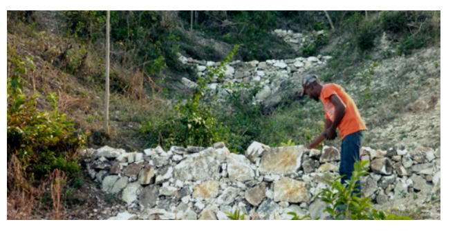
Installation of dry barriers to stabilize the bed of ravines (HELVETAS Swiss Intercooperation)