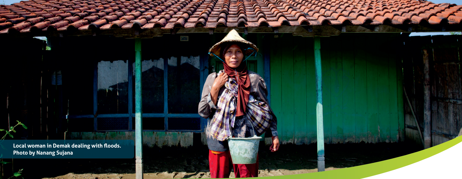
Local woman in Demak dealing with floods.