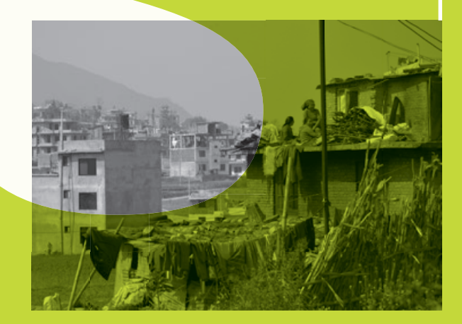
Women in Matatirtha work to build an irrigation system.