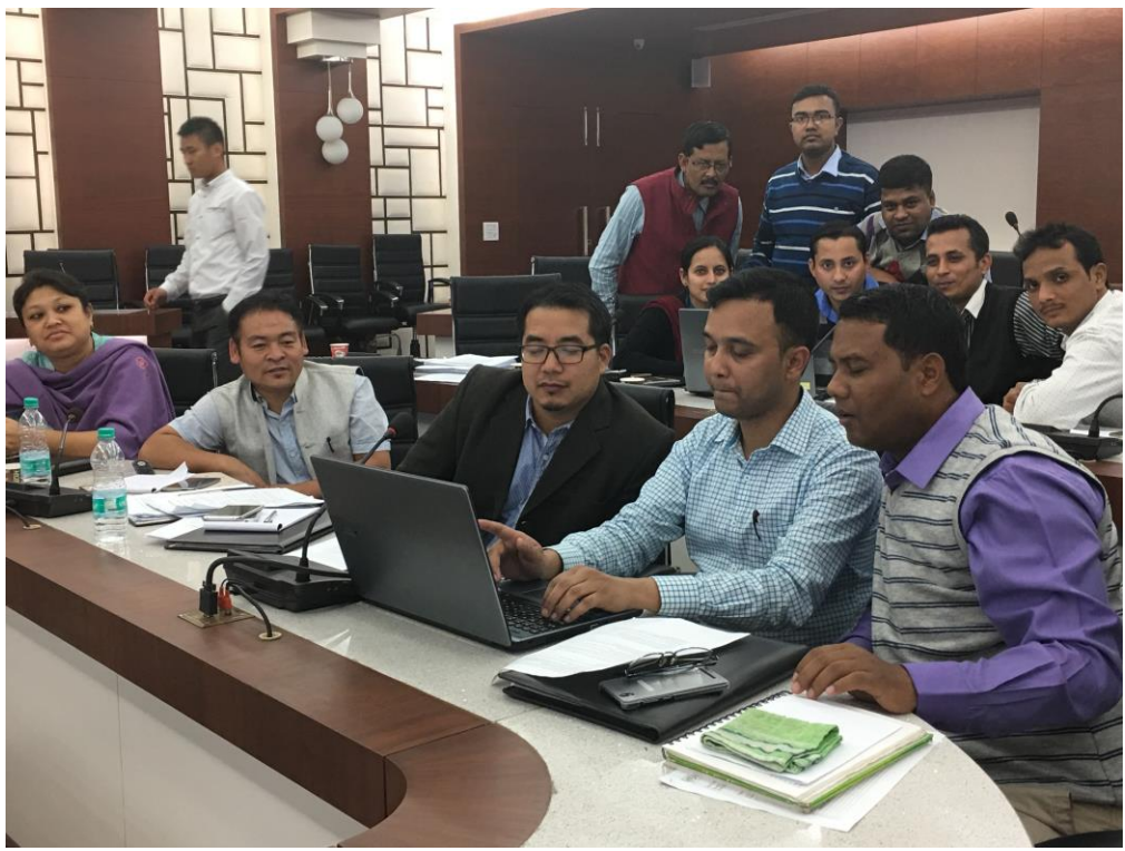
Group discussion on the Draft Urban Local Indicators