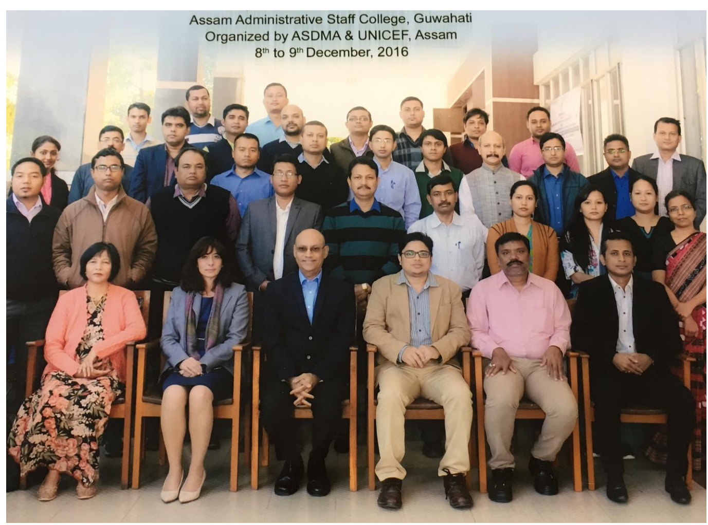
Closing workshop with second group of participants 9 December 2016.