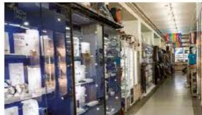
SAFI SHOP Building S - Floor -1