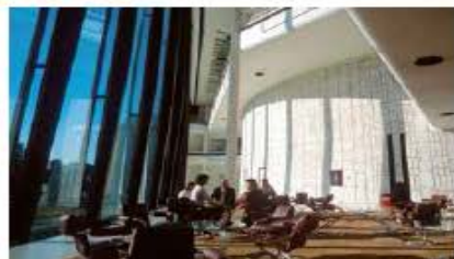
SERPENT BAR Building E - 1 st Floor