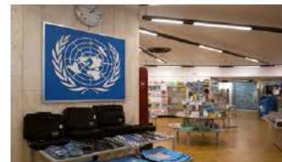
BOOKSHOP | SOUVENIRS Building E - 2 nd Floor