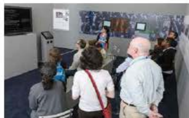
LEAGUE OF NATIONS MUSEUM Building B - 1 st Floor