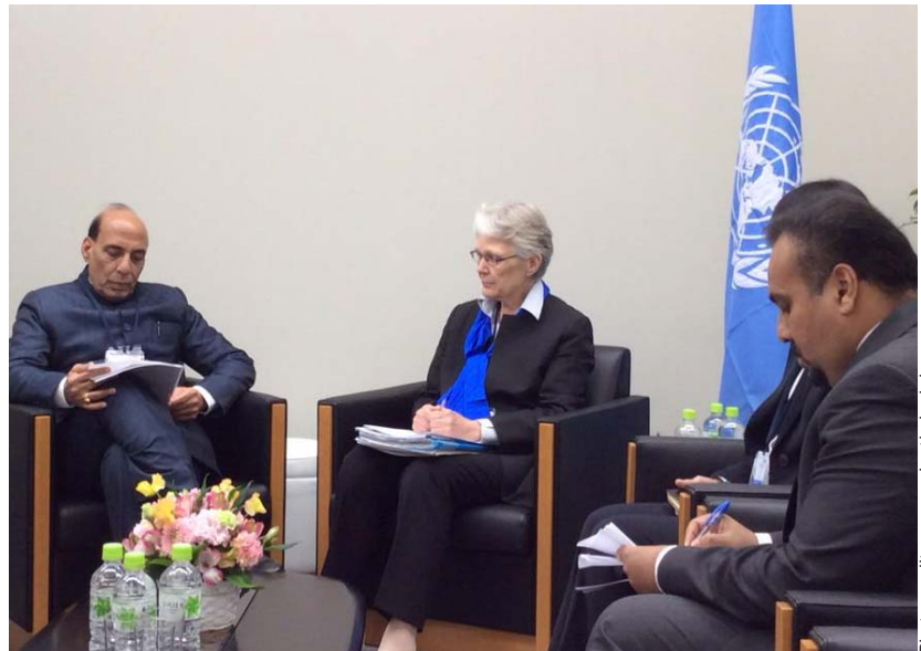
The UN Office for Disaster Risk Reduction (UNISDR) Head Ms Margareta Wahlstrom meets the HM Rajnath Singh at WCDRR in Sendai.

The Hyogo Framework for Action has provided a blue print for disaster risk reduction activities including promotion of culture of prevention, mitigation, preparedness and resilience at all levels. Since then, considerable progress has been made by investing resources and enhancing capacities in dealing with the disasters. However, much needs to be done in the future. We are pleased to note that the post-2015 framework has provided us a practical and useful document with people-centered preventive approach to disaster risk. This would contribute to the reduction of disaster risks and strengthen resilience of the poor and the most vulnerable. We need to take risk informed decisions while making public and private investments. Mainstreaming disaster risk reduction in development programmes and community resilience building are some of the noteworthy features in the new framework. Indeed, the concurrent post-2015 focus on sustainable development, climate change and disaster risk would further provide the international community with a unique opportunity to ensure coherence and alignment across