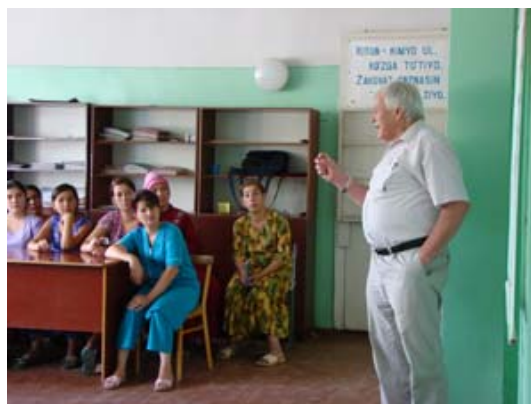
Community seminar at school #116