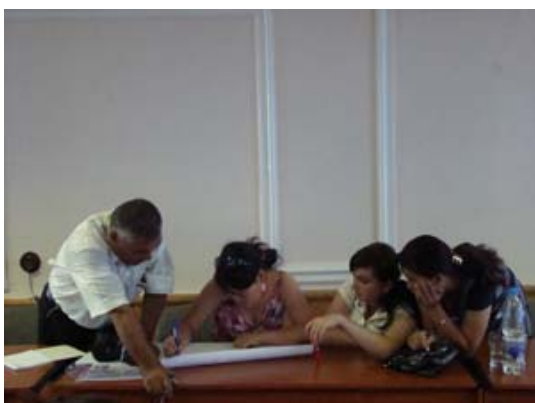
Group work at Training Workshop