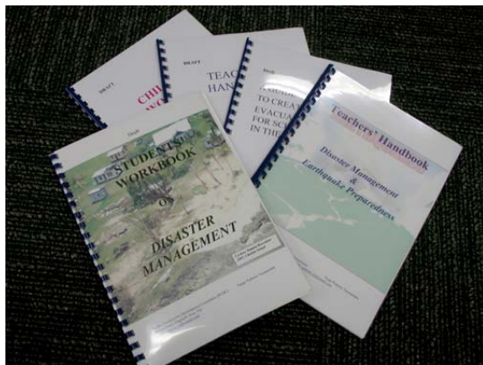
Educational materials in development in Fiji