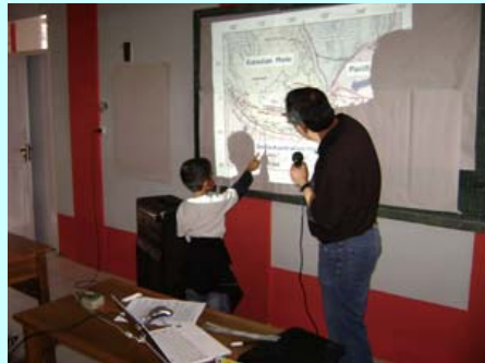
Top: Education for DRR Bottom: Earthquake evacuation drill