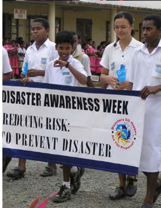
Top: School children at a public seminar supported by Shimla District Commissioner with a support from DIPECHO in Shimla, India