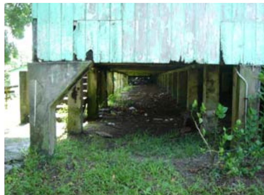
Balantine Memorial School in Suva, Fiji