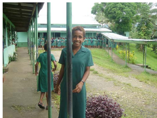
Balantine School in Suva, Fiji

UNCRD also involves the expertise of local scientific institutions such as the Fiji Institute of Technology (FIT), the Centre for Appropriate Technology and Development (CATD) and the Fiji Institute of Engineers (FIE). In order to mainstream earthquake preparedness as an integral part of education and for facilitating wider dissemination of information, UNCRD collaborates with Fiji Social Service Council (FSSC) as well. The local government bodies such as the Public Works Department (PWD) are also involved for greater accountability and implementation of the project at the community level.