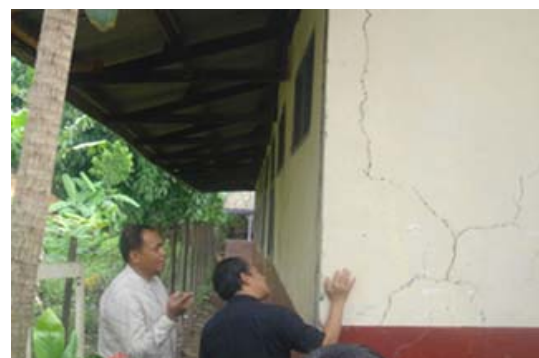
Left top: SDN Cirateun Left bottom: SDN Cibodas II