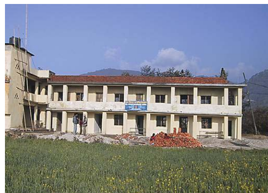
Bal Vikas Secondary School, Nepal Top: Before school retrofitting Bottom: After retrofitting