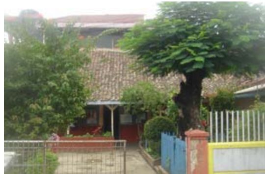
SDN Cirateun before retrofitting

In the process of retrofitting, CDM/ITB provided basic on-site training and briefings to the local contractor on retrofitting works and supervised the work by inspection, control, and guidance/direction.