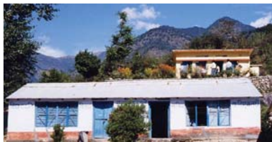
School building in Chamoli, India

As the initial stage, field survey was conducted to study the issues of School Earthquake Safety in Bengkulu, Indonesia, Kathmandu, Nepal, and Chamoli, India.