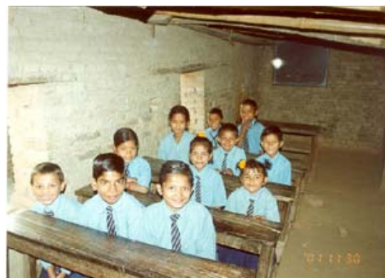
Left: School children in Bengkulu, Indonesia Right: School children in a classroom, Kathmandu, Nepal