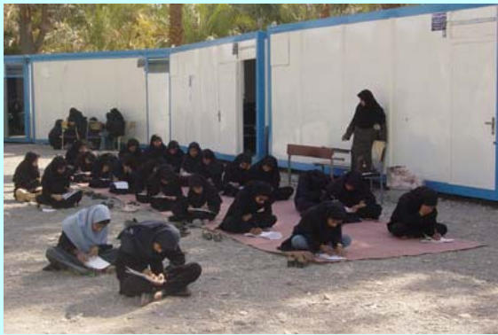
Left top: School children in Nepal Left bottom: A class in a tent in Ache, Indonesia Right: A class outside, Iran