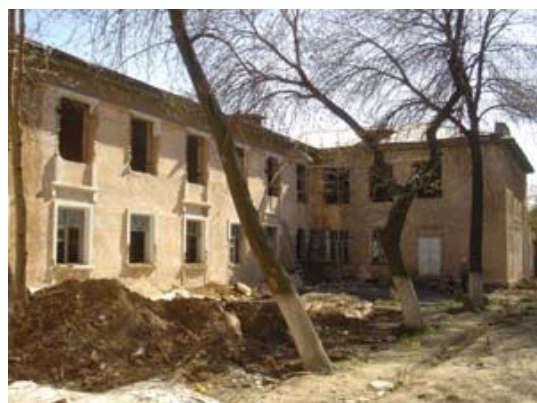
School retrofitting, in Tashkent, Uzbekistan

In order to realize and effective recognizable link to the local Educational and Professional tradition in the area, and allow a standard analysis, the characterization has to deal with the previous study on the Risk Assessment in the area in the framework of IDNDR RADIUS project.