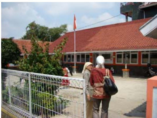
SDN Cirateun after retrofitting