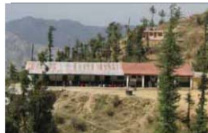
Right: Government Primary School, Junga Center: 5. Government school for differently abled children, Dhali Right: Government Primary School, Mundaghat