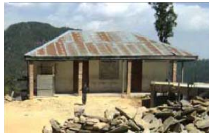
Left: Government Senior Secondary School, Mashobra Center: Government Senior Secondary School, Kufri Right: Government Primary School, Koti