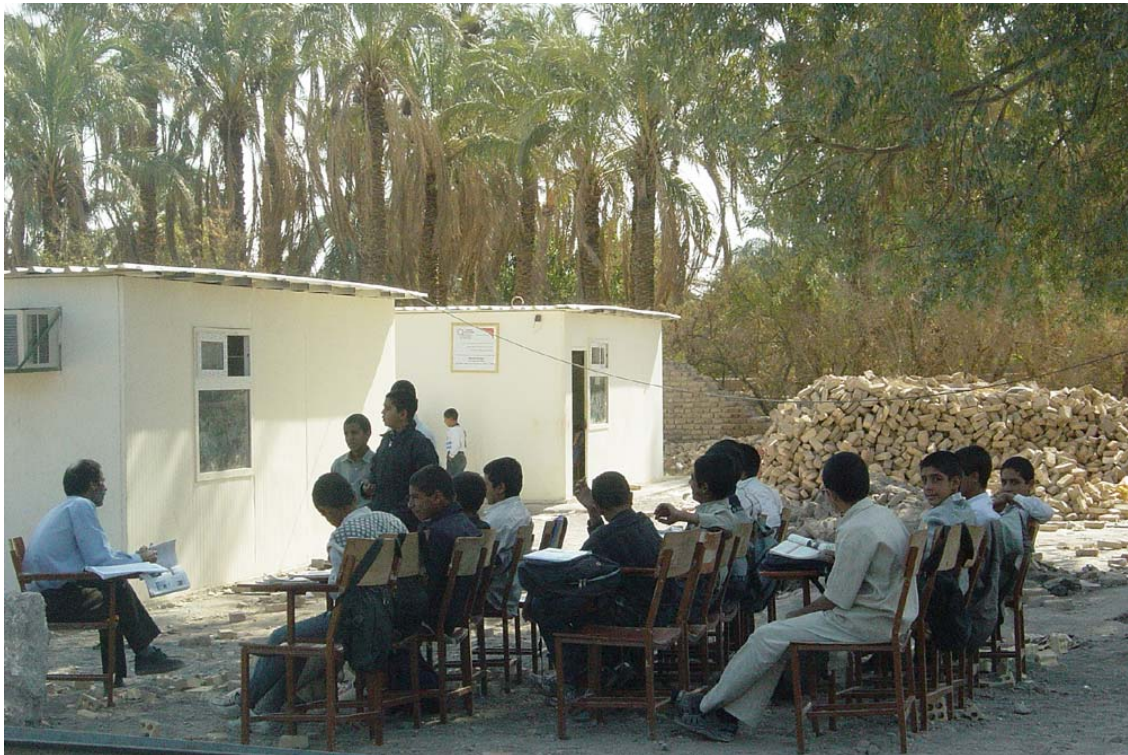
A class after an earthquake, Iran

Therefore, school buildings need to be protected from disasters as they save life of children and they can also help to work as shelter in post disaster scenario. Moreover, safe schools are effective medium for disseminating disaster risk reduction awareness in the communities, can act as center of learning, can be instrumental in transfer of technology to the communities and will have significant role to build disaster resilient communities. The activities like retrofitting of school and new construction with safety measures can spread message to the community of the importance of safe buildings to reduce disaster impact.