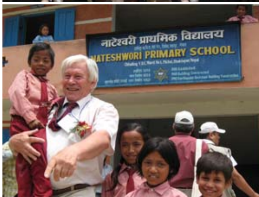
Top: Opening Session Bottom: Field Trip