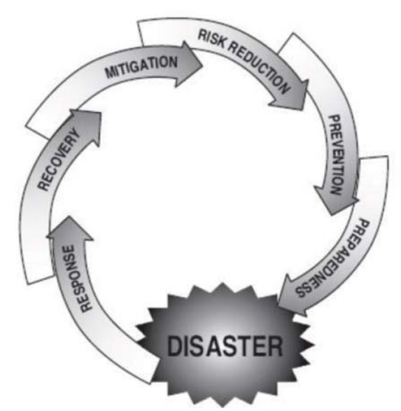
Figure 1. Disaster Management Cycle.

In a typical disaster management (Figure-1), disaster preparedness constitute the predisaster planning phase i.e. before disaster occurs and response, recovery and mitigation as the postdisaster planning phase i.e. disaster prevention phase. In the disaster prevention phase, GIS is used to manage the large volume of data needed for the hazard and risk assessment. In the disaster preparedness phase, it is a tool for the planning of evacuation routes, for the design of centers for emergency operations, and for the integration of