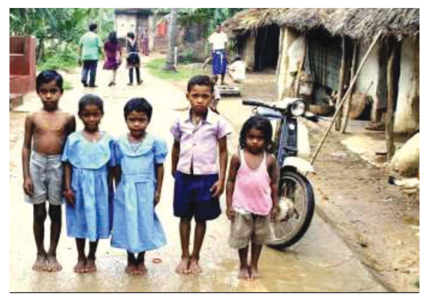
Children receiving Primary Education (SSA), Gunjigaon Village, Kandhamal.

My internship with School of Good Governance and Policy Analysis, Government of Madhya Pradesh for the preparation of District Disaster