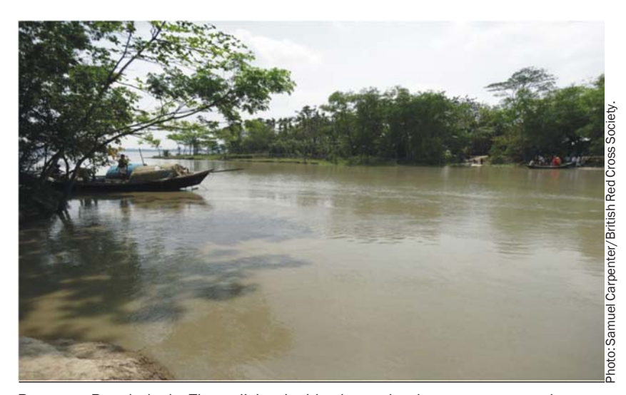
Barguna, Bangladesh: Those living inside the embankment are not only most exposed to the impacts of storm surges but are generally also the most vulnerable members of the community.

In rural areas, the efforts of Red Cross and Red Crescent Societies are increasingly directed at strengthening the resilience of at risk communities. In southern Bangladesh, for example, we are working with the Bangladesh Red Crescent Society and our partners in the German and Swedish Red Cross Societies to help communities manage the risk and impact of a range of shocks and stresses, especially cyclones and floods. Here, we are community-based, volunteer-led approach which brings together livelihoods, sanitation and hygiene and disaster risk reduction support within an integrated risk management approach. In seeking to measure our contribution to the resilience of the communities we are working with, we will assess our impact on six characteristics of community resilience: knowledge and health; organisation; connectedness; access to