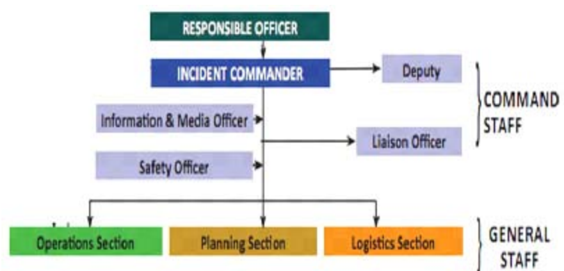
Fig 1: IRT Architecture

Disaster response is typically a six step process – prepare, assess, plan, coordinate, implement and monitor. IRS draws on this process in totality and adopts a unified approach to eliminate gaps in response. To eliminate adhocism, IRS entails pre-nomination of various positions of