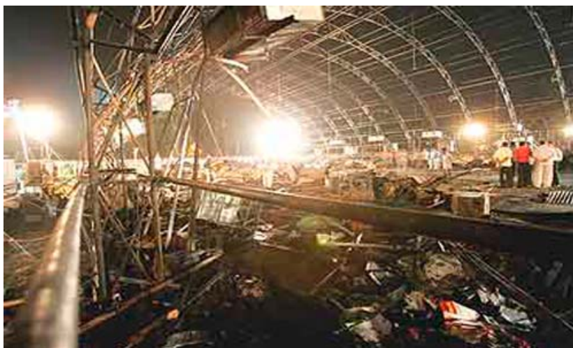
The aftermath of the fire accident at a school in Dabwali, Haryana.