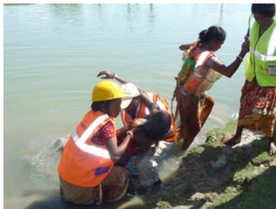
A woman rescued by Search and Rescue team in West Bengal.

For example, ECHO partners have been working in the Sunderbans delta in West Bengal, which is frequently hit by floods and cyclones, putting in place village teams responsible for early warning systems, search and rescue operations, first aid, and child and women protection during a natural disaster. Each team has received specialized training and necessary equipment such as stretchers and first aid kits. Mock drills are also being organised to raise awareness amongst the villages.