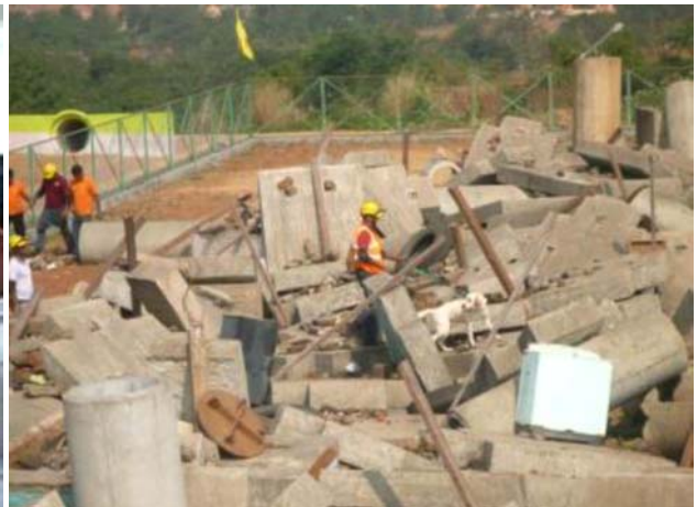
Training of NDRF personnel towards INSARAG External Classification.