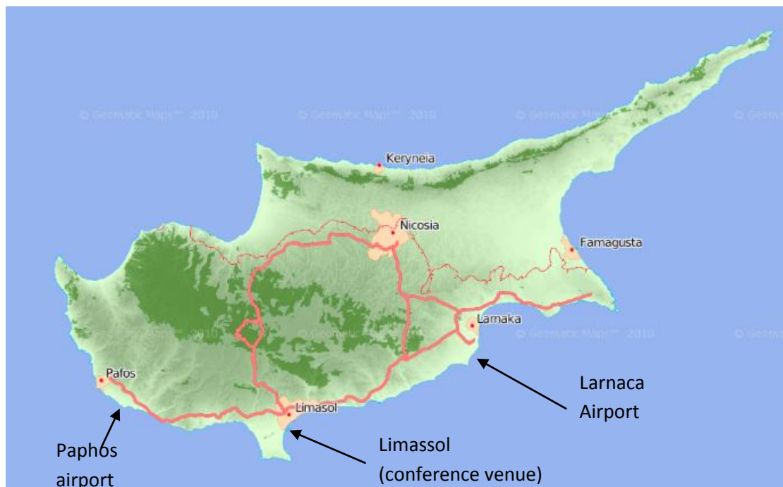
Map of Limassol

The venue is in the city of Limassol which is located about equidistant between Larnaca and Paphos airports. Transportation to and from the airport has been arranged for the conference participants that have requested this, with the company Abelair.