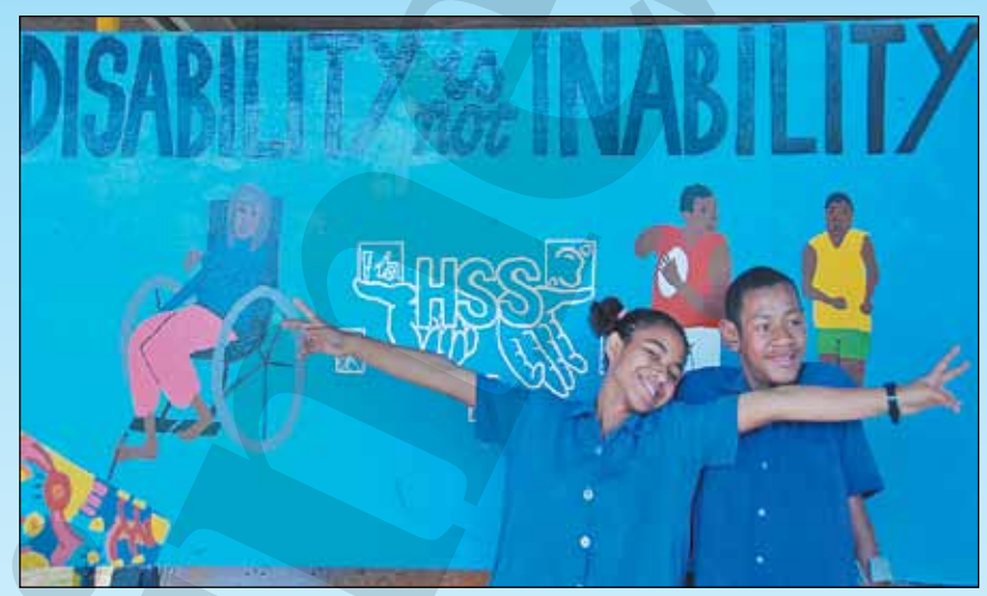
Child Centred Climate Change Adaptation (4CA) program, funded by Australian Agency for International Development (AusAID) and Plan International Australia (PIA).

According to Ms Chand, the focus of the International Day for Disaster Risk is People Living with Disability and on many occasions' issues like accessibility, participation, social inclusion, and contribution are barriers that people living with disabilities face every day and it is even greater for children living with