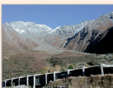
Field Visit 1: Route du Grand St. Bernhard Risk management along an international transit route

Disaster Risk Reduction in the Swiss Alps: challenges and opportunities. On Friday 24 May, Switzerland invites registered Global Platform participants to choose one from three field visits. The field visits will be from 08:00 to 18:00 hours. Participants will depart from and return to Geneva main train station (Cornavin). The cost is 50 CHF (Swiss Francs) per participant. As capacity is limited, the registration for the field visit will be on a first come, first served basis. The aim of the field visits is to provide an insight into the threats, challenges and coping measures of living in a risk-prone alpine environment. For more information please visit: www.preventionweb.net/globalplatform/2013/programme/field-visits