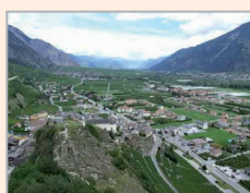
Field Visit 2: Rhone River Flood risk management