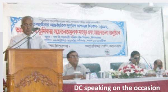
DC speaking on the occasion

might act as the best change agents and mass awareness development through the student is one of the best ways. Focusing the theme of the day of this year, through a coordination meeting, different events of the day was planned and implemented in the ground of S.V. Girl's High School, such as simulation, discussion meeting and quiz competition.