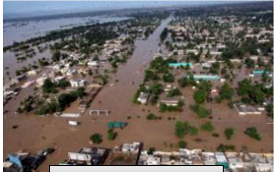
Floods-2010 in Naushera