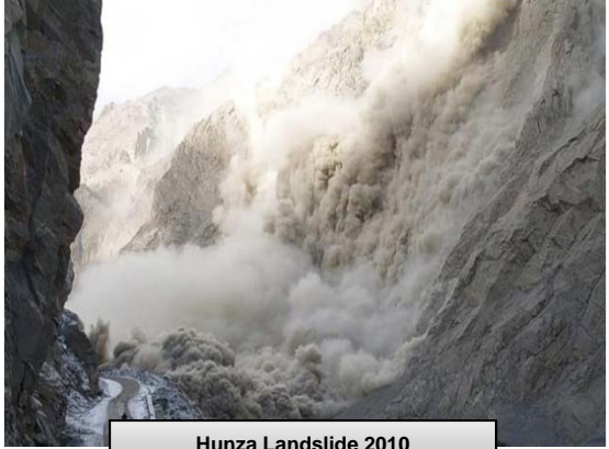
Hunza Landslide 2010