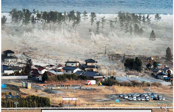
Tsunami March 11, 2011 Japan