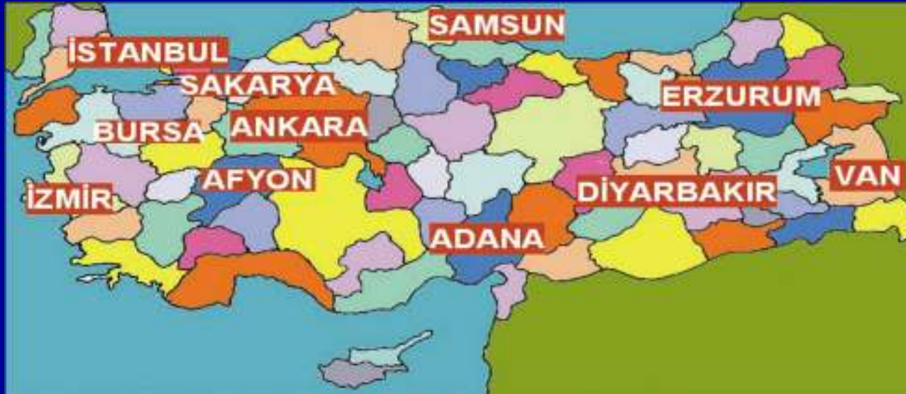
Civil Defence Battalions in 11 Provinces