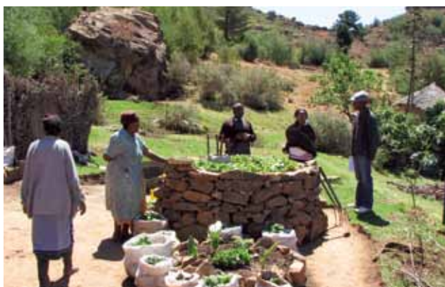
Increasing agricultural production in the project area