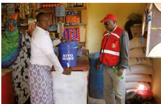
Using a clay filter