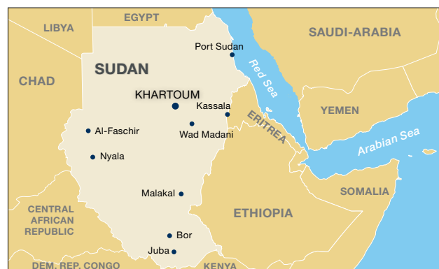
Borders as of January 2011

The aim of this project was and still is to improve access to primary health care for the population of northern