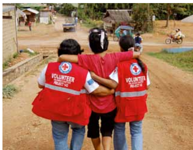
Filipino first aid volunteers in action