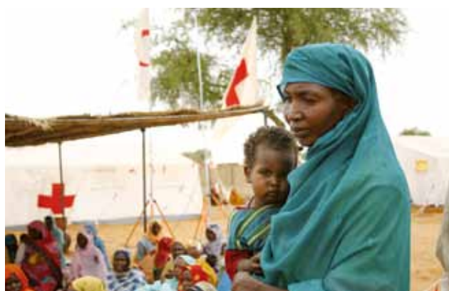
Women at the IDP camp of Abu Shock have access to health care