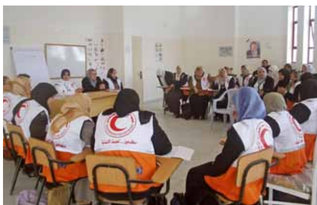
Women's groups are trained to set up micro projects

Motherhood Committees in charge of health promotion in the communities. These trainings are facilitated by technical staff of the Palestinian Red Crescent. The topics are chosen by the committee members who disseminate the resulting messages on an independent basis. The second project component is about developing and implementing micro projects to achieve direct improvements in local living conditions and build social services in the communities, for instance by establishing women's meeting points and childcare facilities. Through this assistance the Red Crescent empowers women to plan and run micro projects on their own account.