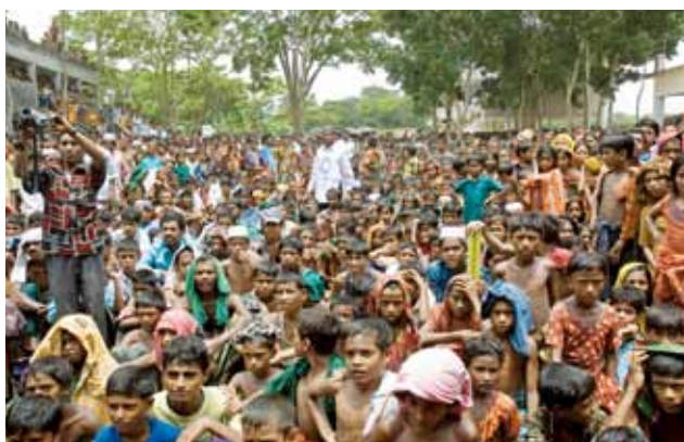
The people of Bangladesh are particularly hard hit by climate change.