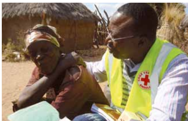
Advice and support for PLWHA in Angola