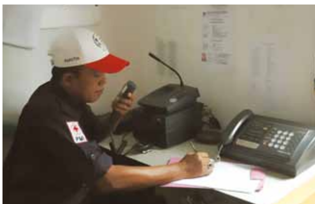
Indonesian Red Cross staff operating an emergency control centre