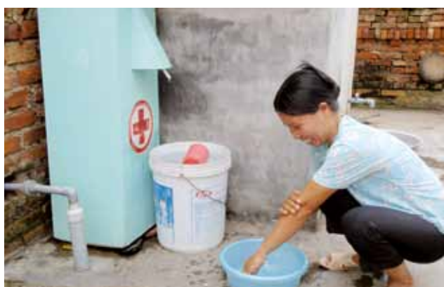
Filters provide access to clean drinking water in North Vietnam