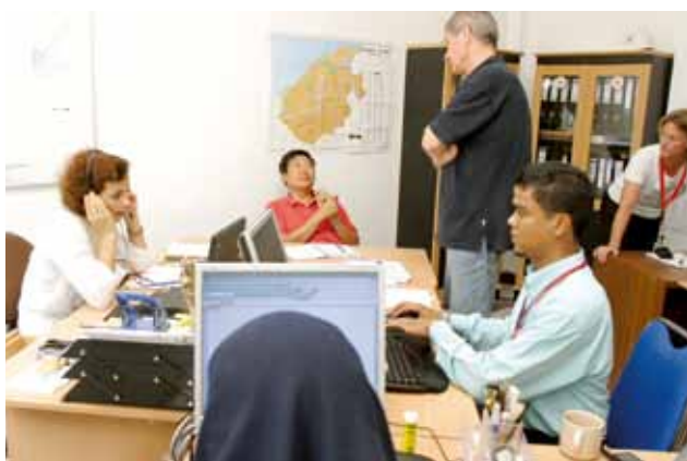
After the Tsunami GRC office in Indonesia

The GRC provides technical guidance and knowledge transfer throughout all project phases and thus guarantees the quality of project implementation under technical and practical aspects. This is an essential condition for the long-term success of every DC activity. GRC delegates receive support for their role, primarily from their respective country desk at National GRC Headquarters in Berlin, and as far as possible also from the GRC field office responsible for their respective region.