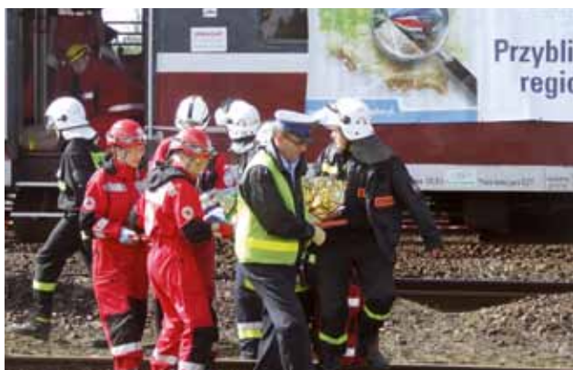
A trained intervention team of the Polish Red Cross