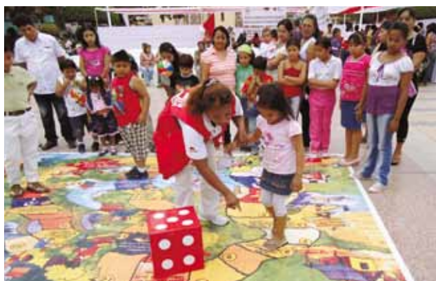
Playful learning about natural hazards in Peru