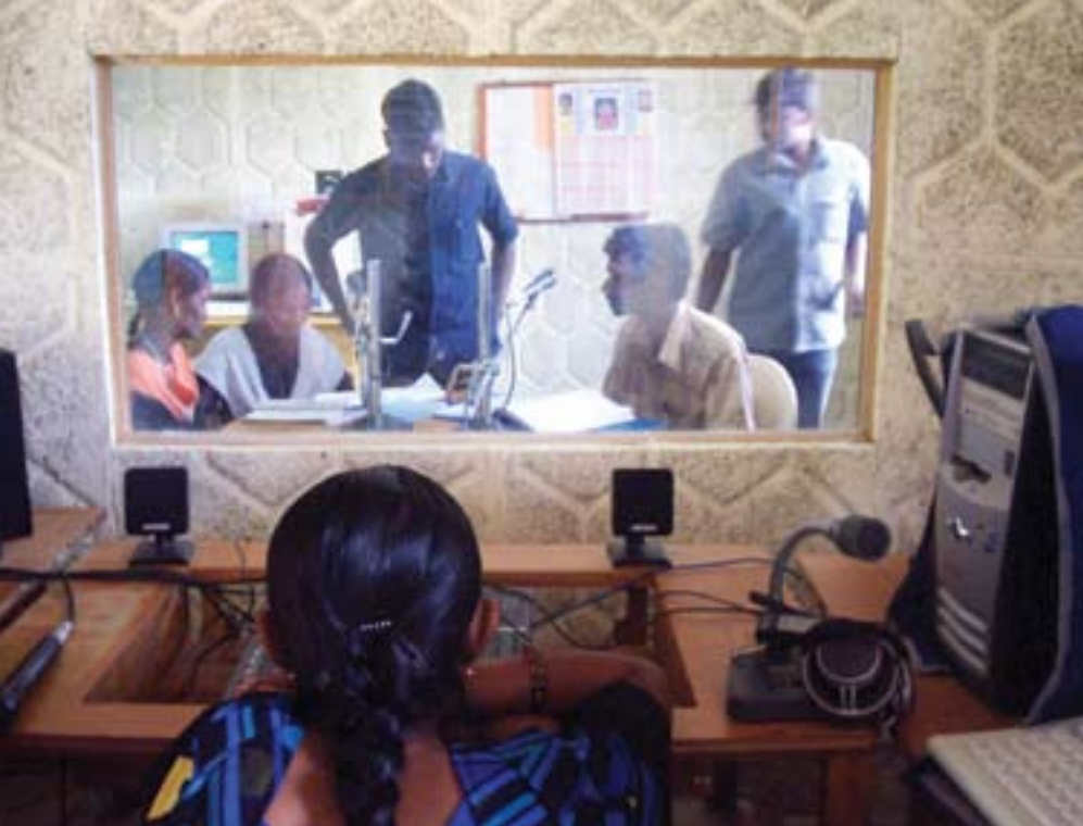
Community radio gives a voice to the people

groups have been formed to strengthen and consolidate strategies among all partners. The resource centres, in addition, conduct independent studies to gather information on the ground situation of the recovery process. They have also brought to the spotlight, issues of vulnerable and socially marginalised groups.