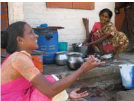
Sanitation has to be in line with community needs

Major infrastructure projects such as roads and sewer treatment plants are best planned and executed at the state level. But most reconstruction decisions are at the village or district level. Mechanisms need to be put in place at the site level to provide backup support for technical solutions on various reconstruction issues in relation to design, execution, and habitat planning. One possibility is district-level centres, each supported by a team comprising of a civil engineer, a sanitation engineer and a social specialist. This team should work with engineers executing the project, to solve technical issues, strengthen the technical capacity of NGOs and artisan guilds, and promote disaster resistant technologies.