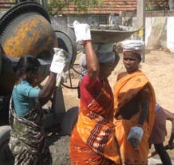
Women building new escape roads

The World Bank is also providing financing of on-site infrastructure for approximately 200 settlements and the reconstruction of four fishing harbours as well as a range of public buildings including hospitals, clinics, and schools.