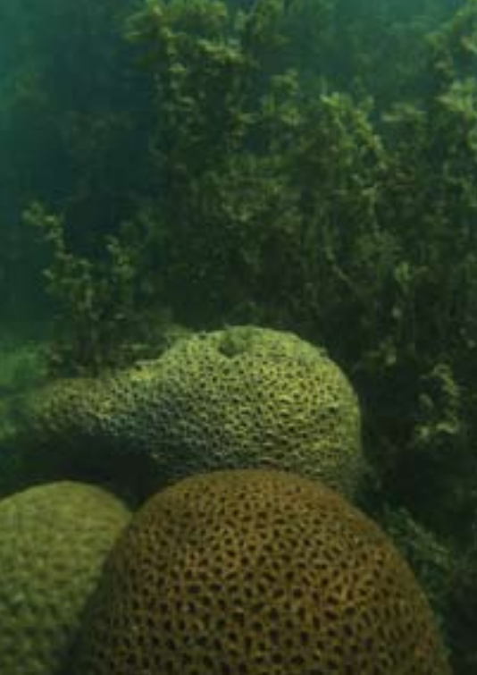
Impact on different ecosystems such as coral reefs are studied now