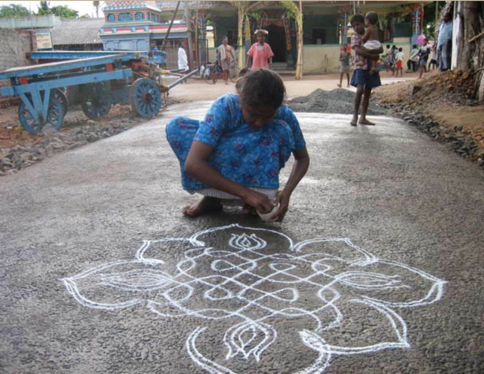
Vanakkam – Welcome! In a Tsunami-affected village near Karaikal a woman draws a welcome drawing called Kolam in Tamil