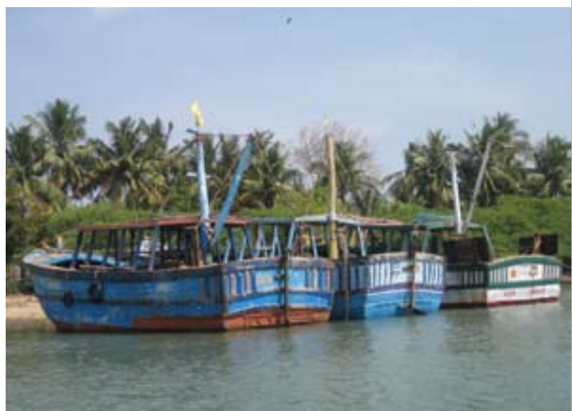
A healthy environment can provide healthy livelihood

they have polluted the coastal areas and fresh water resources along the coast. Soak pits in coastal habitations (both temporary and permanent habitations) are causing pollution of ground water sources. Therefore, alternative technological solutions need to be identified. Local communities have to be made aware of sanitation issues and have to be taught to use the facilities provided. Sanitation should be located away from the sand dunes. Awareness on water quality and environmental health, including secondary contamination is required, as several unhygienic practices exist.