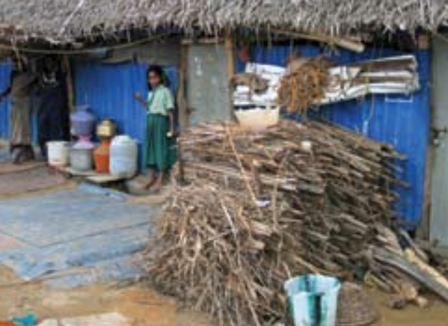
To keep up health conditions in temporary shelters is a challenge

Development Institute (HMDI) have been trained in AFHS, as have 100 medical officers and 300 Village Health Nurses and Sector Health Nurse in the district of Nagapattinam.