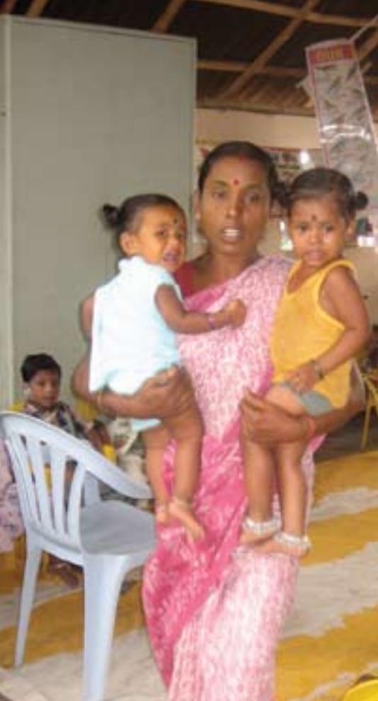
Supporting even the smallest: A child care centre in Nagapattinam