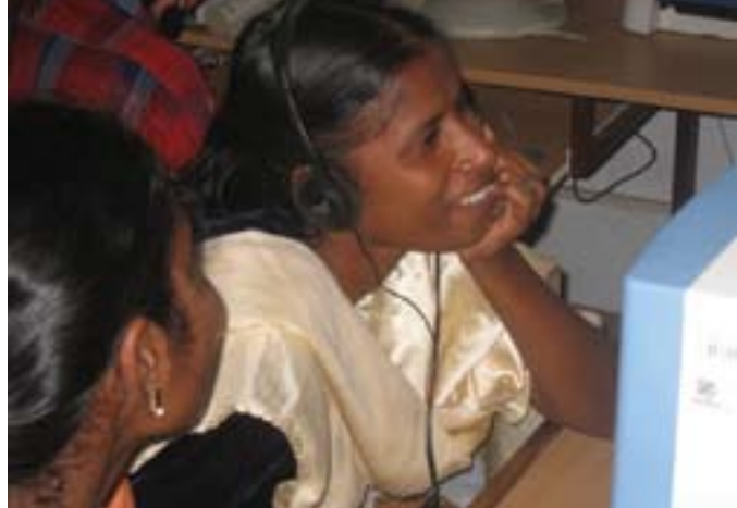
Education provides access to new worlds