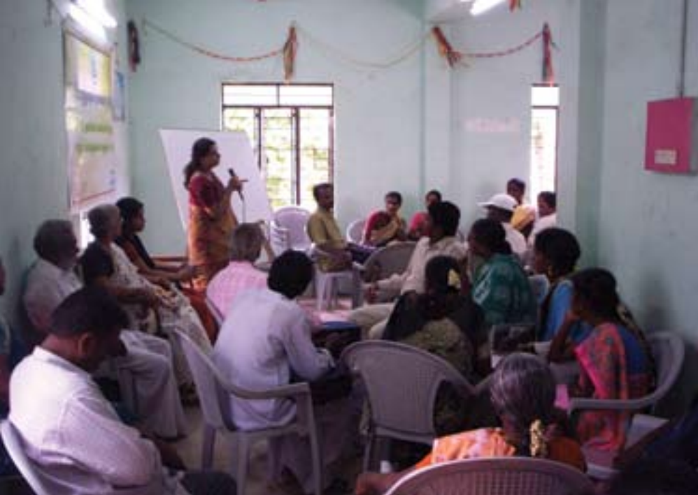
The UN has initiated training on HIV and trafficking issues

people in the Tsunami affected areas was conducted. Based on this, the UN initiated a project to improve the quality of life of people living with HIV and Aids (PLHA) in the Tsunami affected districts. 10 new networks of people living with HIV were set up and the 10 existing networks were strengthened. Through these networks, PLHAs and their families will be supported through livelihood options backed by technical skills training and marketing linkages.