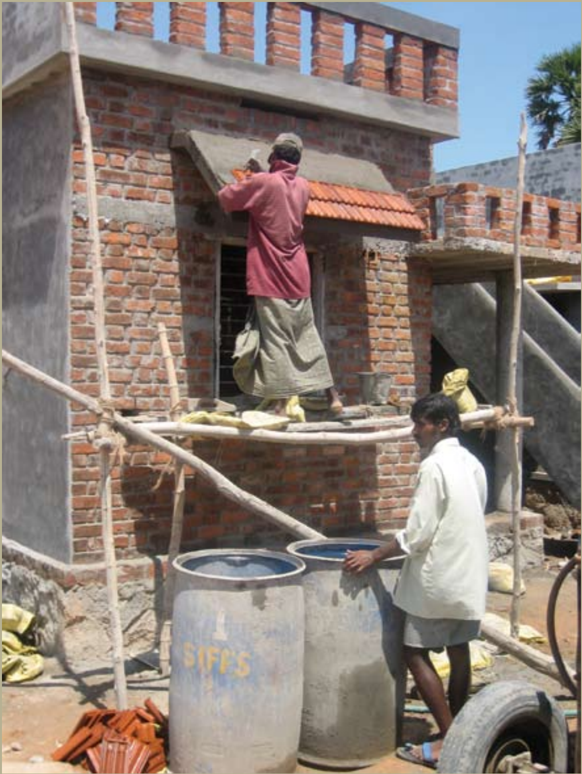
By December 2006 one third of the houses that have to be built is completed