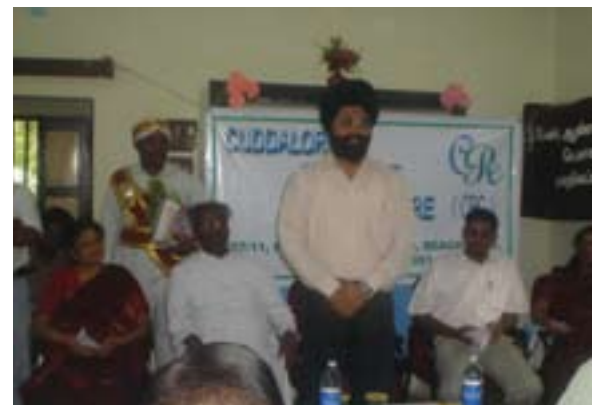
Inauguration of the latest addition: The Cuddalore Resource Centre

New initiatives from central and state governments to establish warning systems and emergency communication networks should be integrated with the modern technologies and private sector investments such as cell phone networks and cable television should ensure warning and information dissemination mechanisms with multiple redundancies.