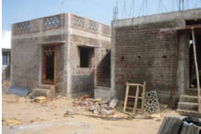
Houses under construction in Nagapattinam: Still many more have to be built