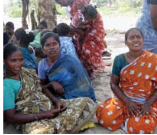
Enhanced health services for women, especially for mothers have been introduced

monitor the quality of drinking water. Forty thousand insecticide treated bed nets were distributed. Subsequently, the post-disaster disease surveillance in affected districts was intensified through networking with National Institute of Communicable Diseases (NICD) in Delhi and the National Institute of Epidemiology (NIE) in Chennai, as well as medical colleges. In Andaman and Nicobar, the planning, implementation and monitoring capacities of the Health Department were strengthened, with vector control measures reaching to all the villages across the islands. Portable laboratories are able to reach these remote islands, confirm cases and ensure that the sick receive timely treatment.