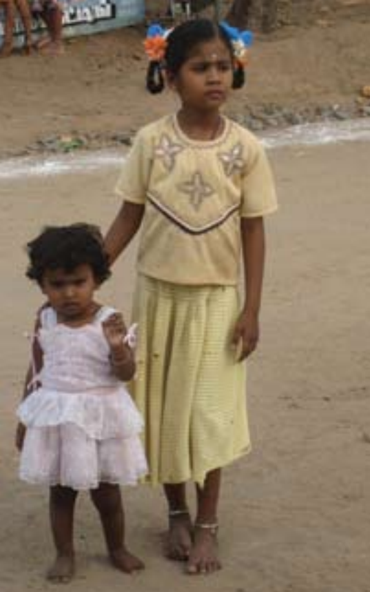
At village level stronger child protection has been implemented

is also engaged in capacity building of caretakers to ensure better standards of care for children in these institutions.