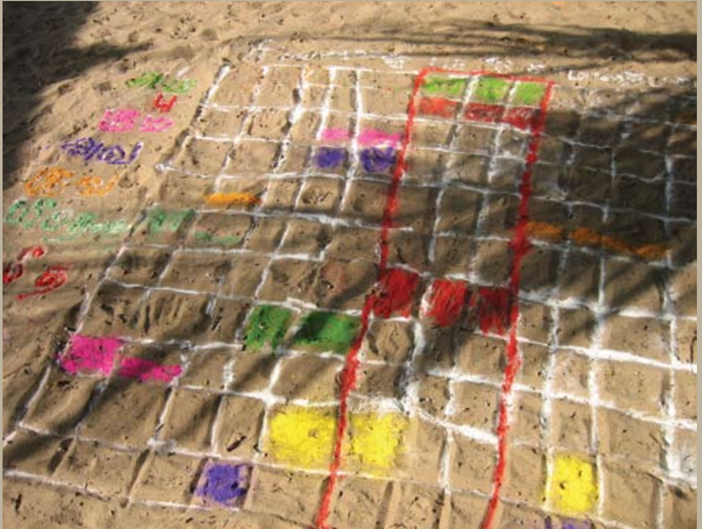
Training at community level: A plan of the months where there is a greater danger of hazards is drawn in the sand