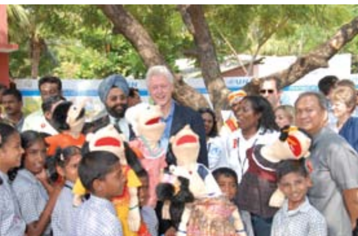
The UN Special Envoy for Tsunami Rehabilitation, Mr. Bill Clinton, visits the Tsunami-affected area in Tamil Nadu in December 2006

The Joint UN office and the UNTRS are in many respects unique in the world. Experiences of the agencies in this new UN set-up have been positive but not without challenges. However, if the willingness of UN-agencies to work together exists, these challenges will be manageable. This has been the case within the UNTRS.