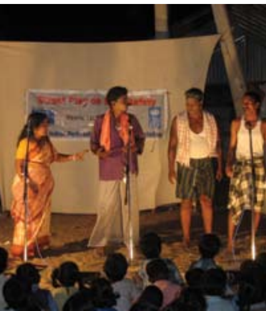
Street plays create awareness on disaster risk management

As a guiding principle for early and long-term recovery, the UN incorporated "Reducing Disaster Risk" as a core crosscutting approach to the UN Recovery Framework. At present, the UNDP is working actively with the Government of Tamil Nadu. It is expected that from 2007 onwards, UN will engage and assist the government of the other three states to take up similar risk reduction activities.