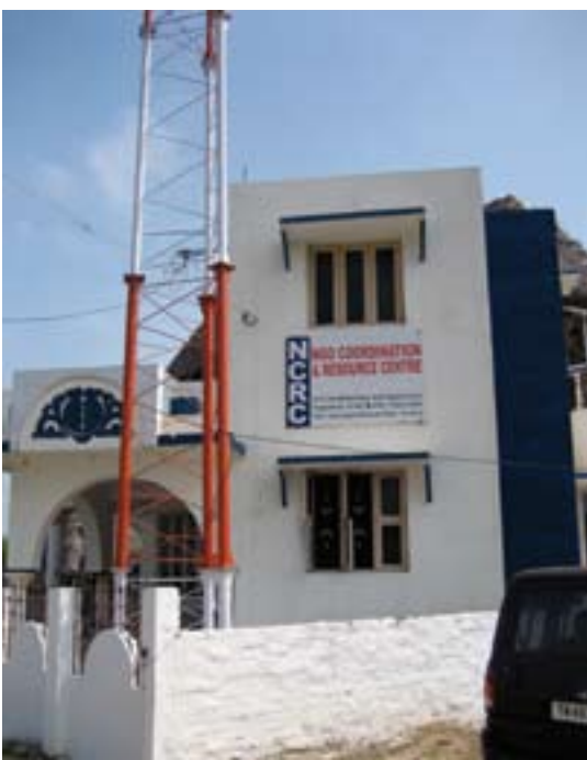
Resource centre in Nagapattinam: Essential to coordination

The coordination meetings, conducted regularly at the resource centres, helps to identify the gaps, reallocate resources and formulate need based strategies in support of Government efforts. Core