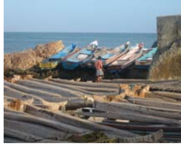
Destroyed and damaged boats were replaced very fast

in formulating a viable policy and sustainably managing the fisheries and related livelihoods. It includes a capacity building programme for the Department of Fisheries.