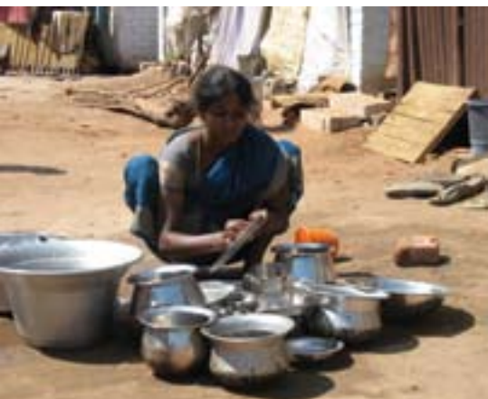
Access to clean and safe water is part of the rebuilding process

International experience indicates housing reconstruction as perhaps the most challenging of tasks in disaster recovery programmes. In India, the scale of destruction caused by the Tsunami was vast: approximately 100,000 homes were damaged or destroyed and the entire physical infrastructure along the coastline was severely affected.