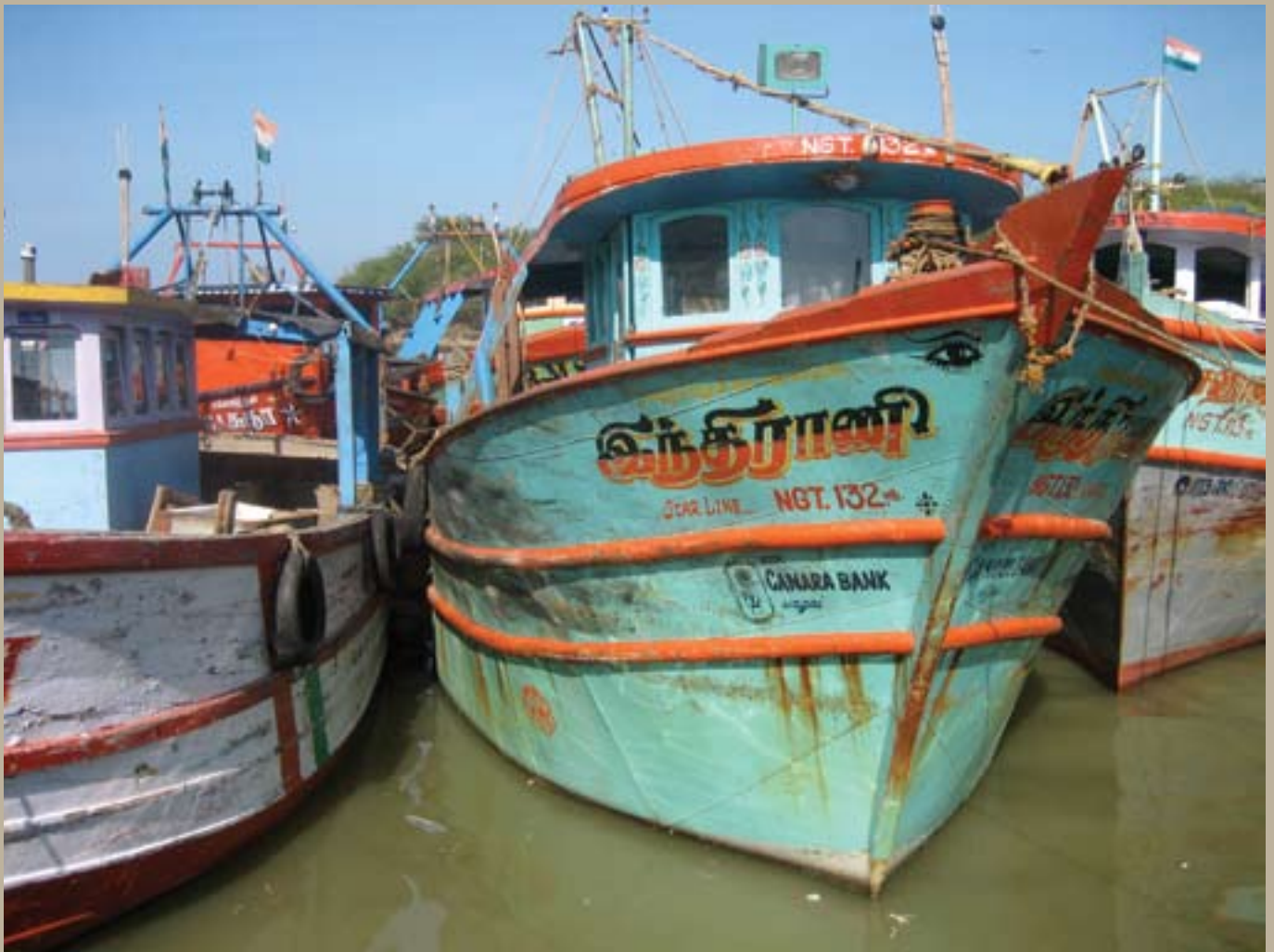
Life in most Tsunami-affected coastal villages has returned to normal. Much has been achieved in Tsunami recovery, but there is still a lot to do