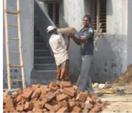
The building process is in full swing throughout all the affected states

In Pondicherry, though 8,382 houses were reported damaged or destroyed after the Tsunami, 7,567 houses are to be constructed or repaired under the Tsunami rehabilitation programmes, as damages to the remaining houses were minor. A total of 575 homes has been completed in Pondicherry and 100 have been handed over. In Andaman and Nicobar Islands, where 9,714 homes needed to be reconstructed, the foundation work has been completed for 8,955 and the Union Territory is awaiting the delivery of materials from the mainland for further construction.