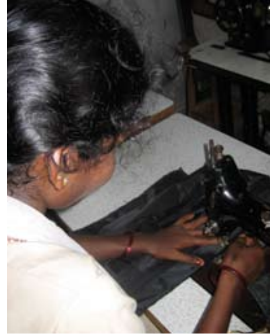
Sewing bags as an alternative income for fisherwomen

In the two worst affected districts of TN, five workshops, where boat engines can be repaired, were established by the UN and its partner SIFFS. Fishermen and youth from the community were taught to repair boat engines and received training in sea safety. Through this, fishermen achieve greater reliability and more safety. Repair and maintenance of engines also leads to lower fuel and hence lower operational costs. The programme on sea safety included sea safety workshops and street plays on village level. At the state level, a workshop generated widespread awareness in a field long overlooked or disregarded. The programme reached 13,500 persons. The government has