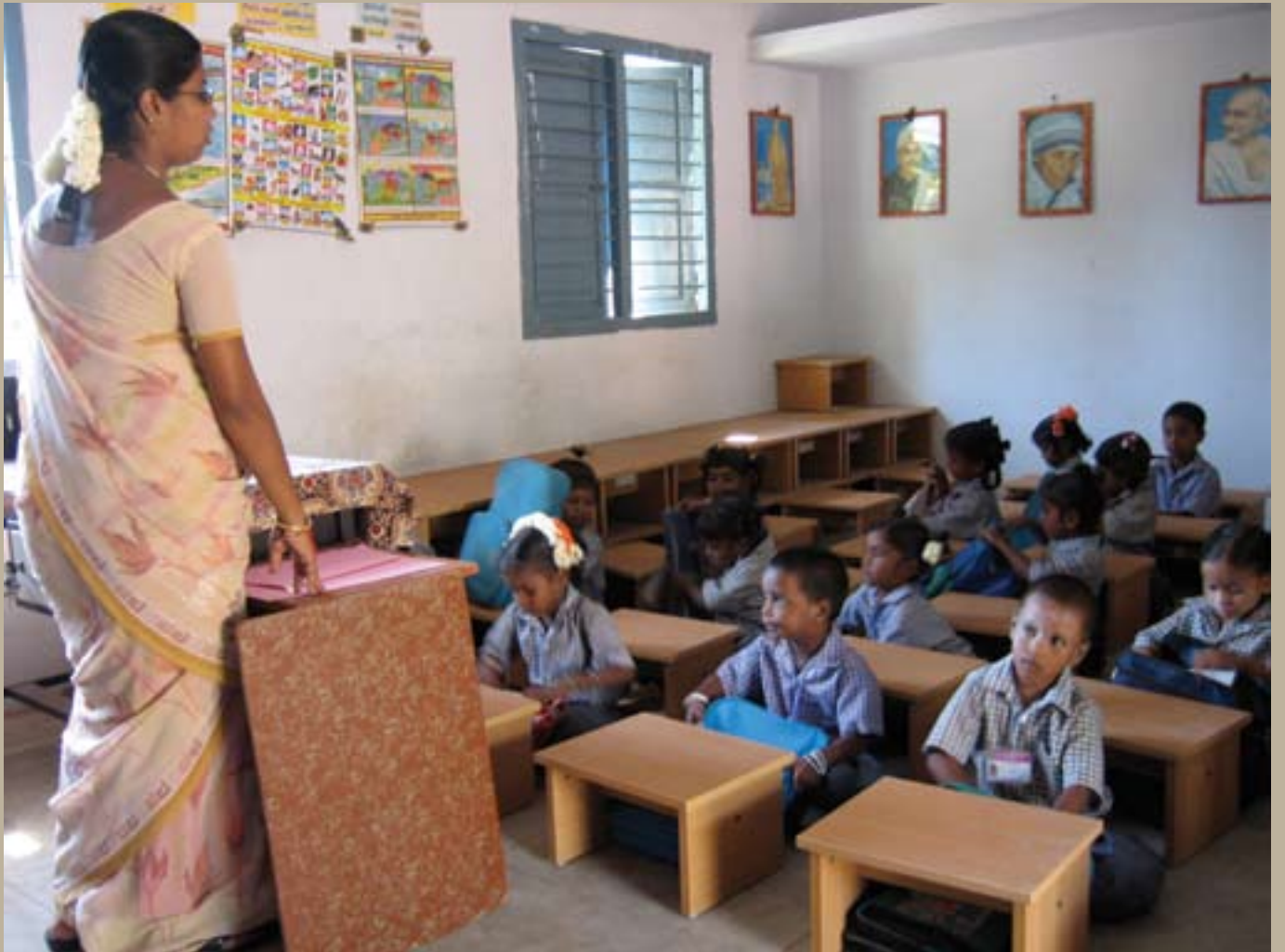
New furniture and new teaching methods make learning more child friendly