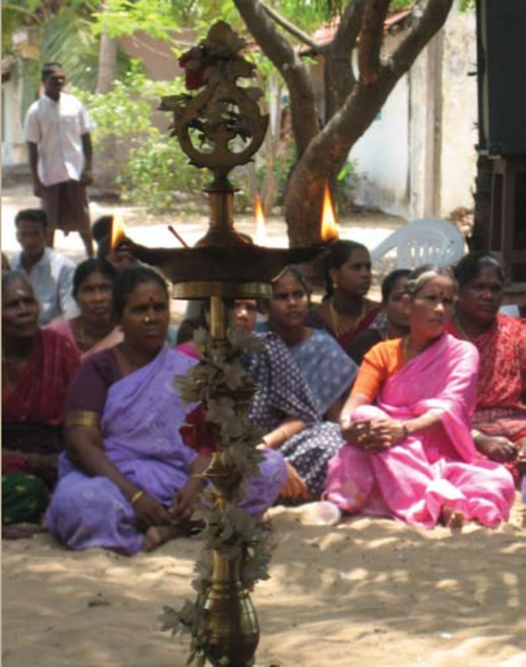
One of the least measurable impacts is the effect the Tsunami has held on the human mind and soul