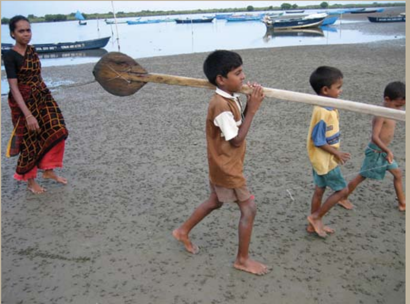
After the Tsunami, in the sense of Build Back Better, women became first time boat owners