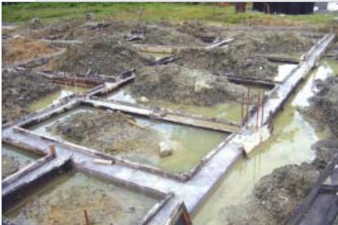
CARITAS-CRS at Badmash pahar