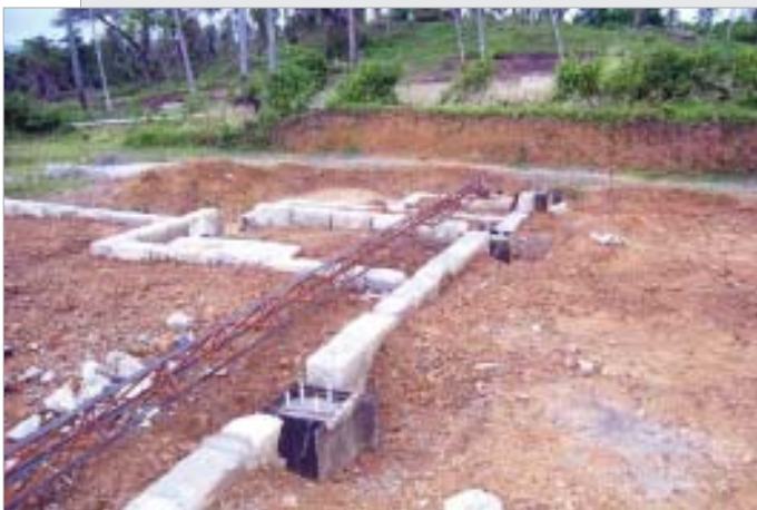
HCC at Bambooflat