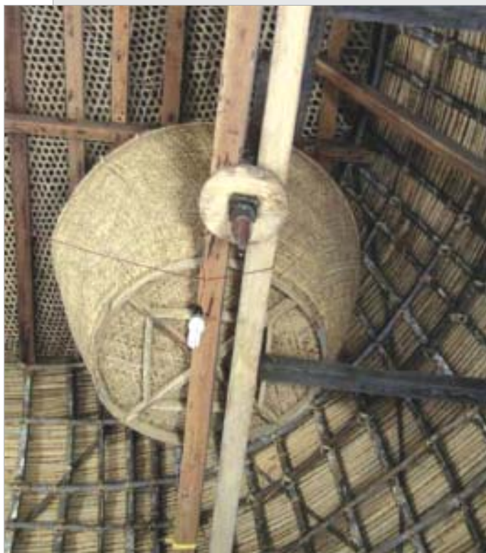
Storage in the traditional houses by making attic space

frame with bolts, in future the availability of appropriate skills and need for appropriate materials may create hurdles for the house owners in regular maintenance.