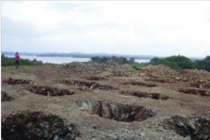
CARITAS-CRS at Mithakhari

NGOs who have made agreements with the government to take up construction of houses as per CPWD guidelines have already initiated the work in South Andaman. CARITAS-CRS, HCC and Mata Amritanandmayi Trust have already started foundation work at their respective sites.