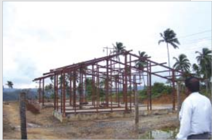
HCC at Bambooflat