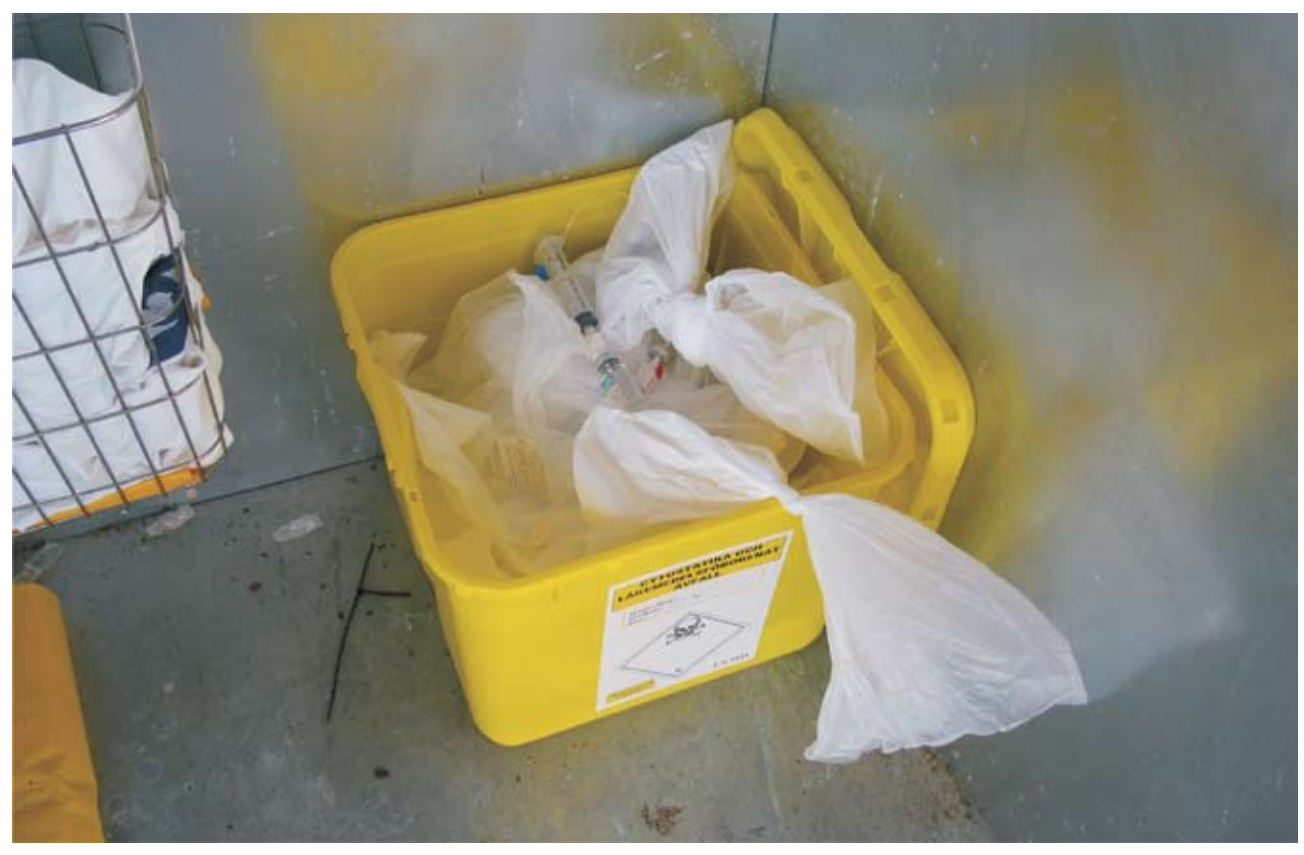
Healthcare waste is segregated and stored in clearly distinguished yellow container awaiting disposal.

Ensuring that a comprehensive communications plan exists as a part of a larger disaster waste management plan. A GIS Information Management System should be used to capture data and act as a central repository for information about current status, work achieved and planned next steps.