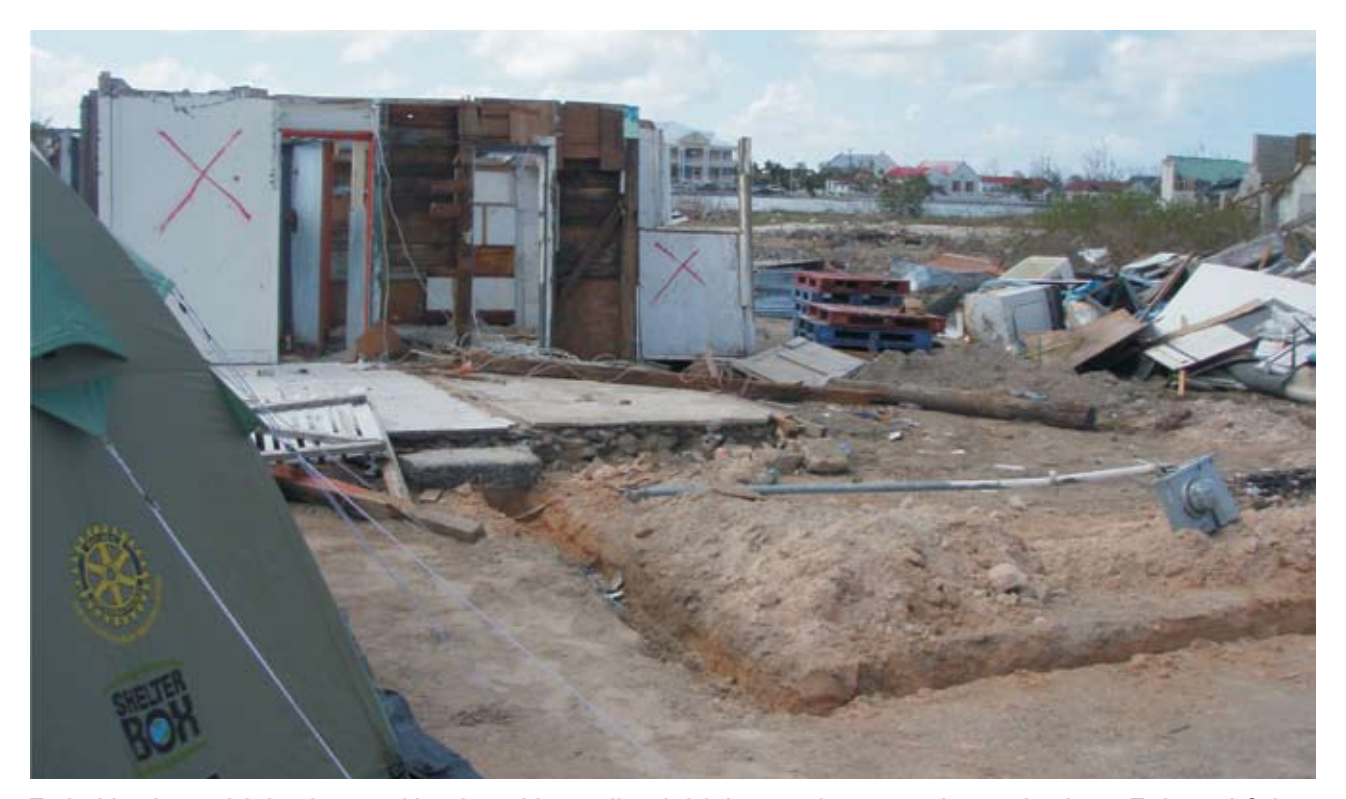
Typical hurricane debris where roof has been blown off and debris spread over area in post-hurricane Turks and Caicos Island 2008.

Unfortunately, current DW management practice often involves either no action , in which the waste is left to accumulate and decompose, or improper action , in which the waste is removed and dumped in an uncontrolled