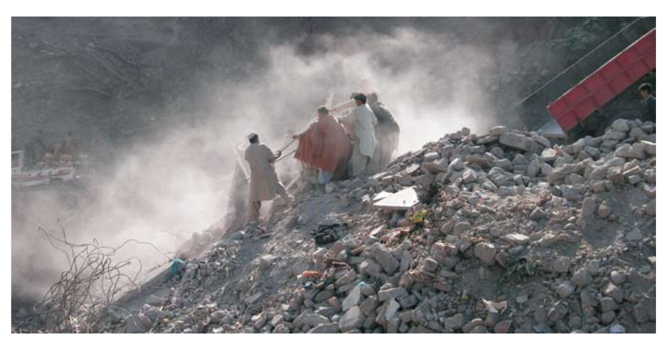
Salvaging scrap metal from post-earthquake debris, Muzaffarabad.