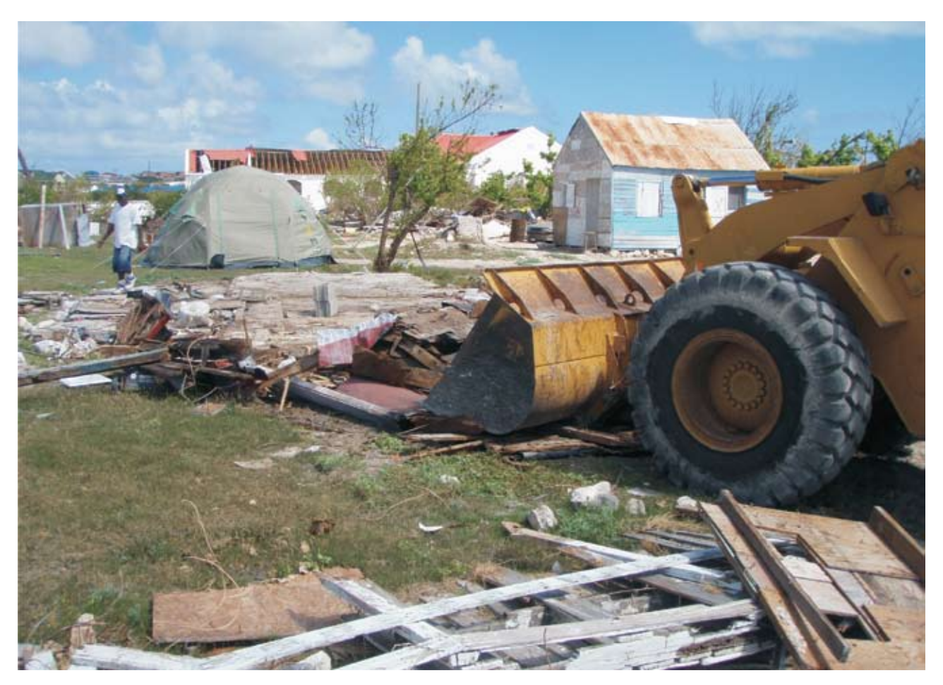
Clearing hurricane debris in post-hurricane Turks and Caicos Island 2008. Note the lack of appropriate equipment to segregate roofing and reusable boards.