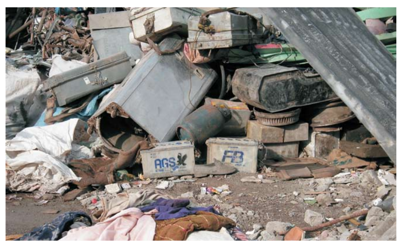
Hazardous waste (car batteries and LPG cylinder) mixed with debris, Balakot 2005.