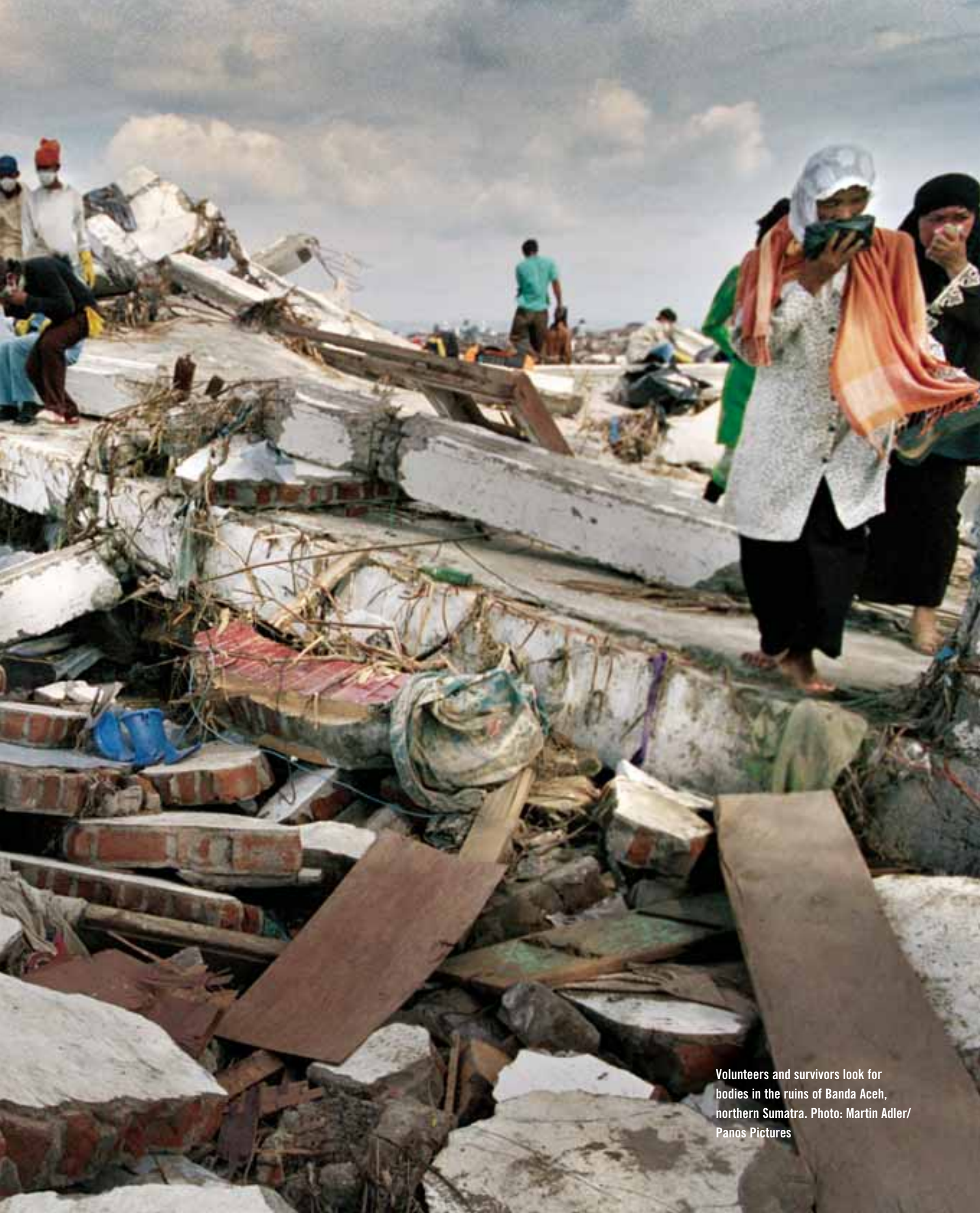
Volunteers and survivors look for bodies in the ruins of Banda Aceh, northern Sumatra.