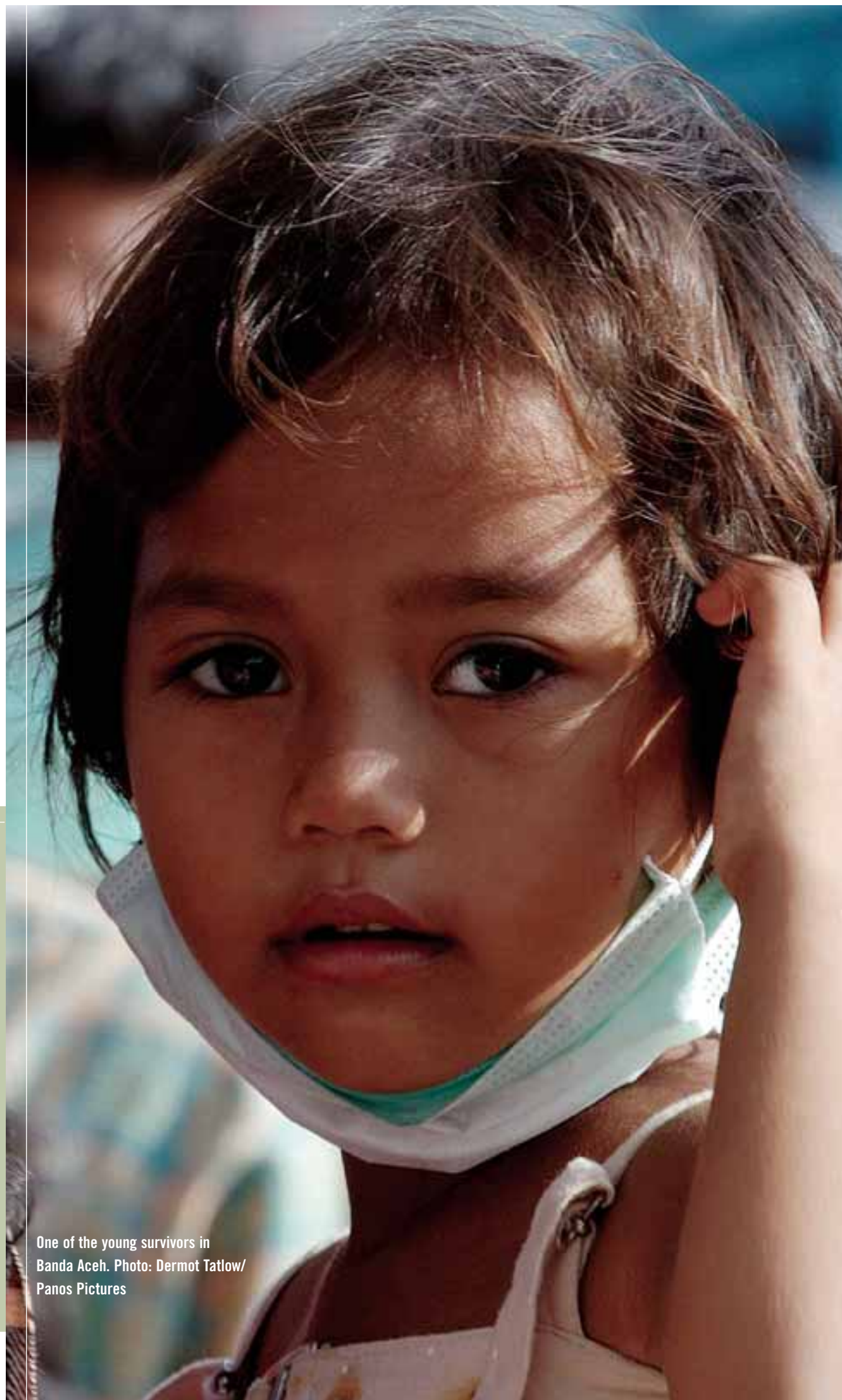
One of the young survivors in Banda Aceh.