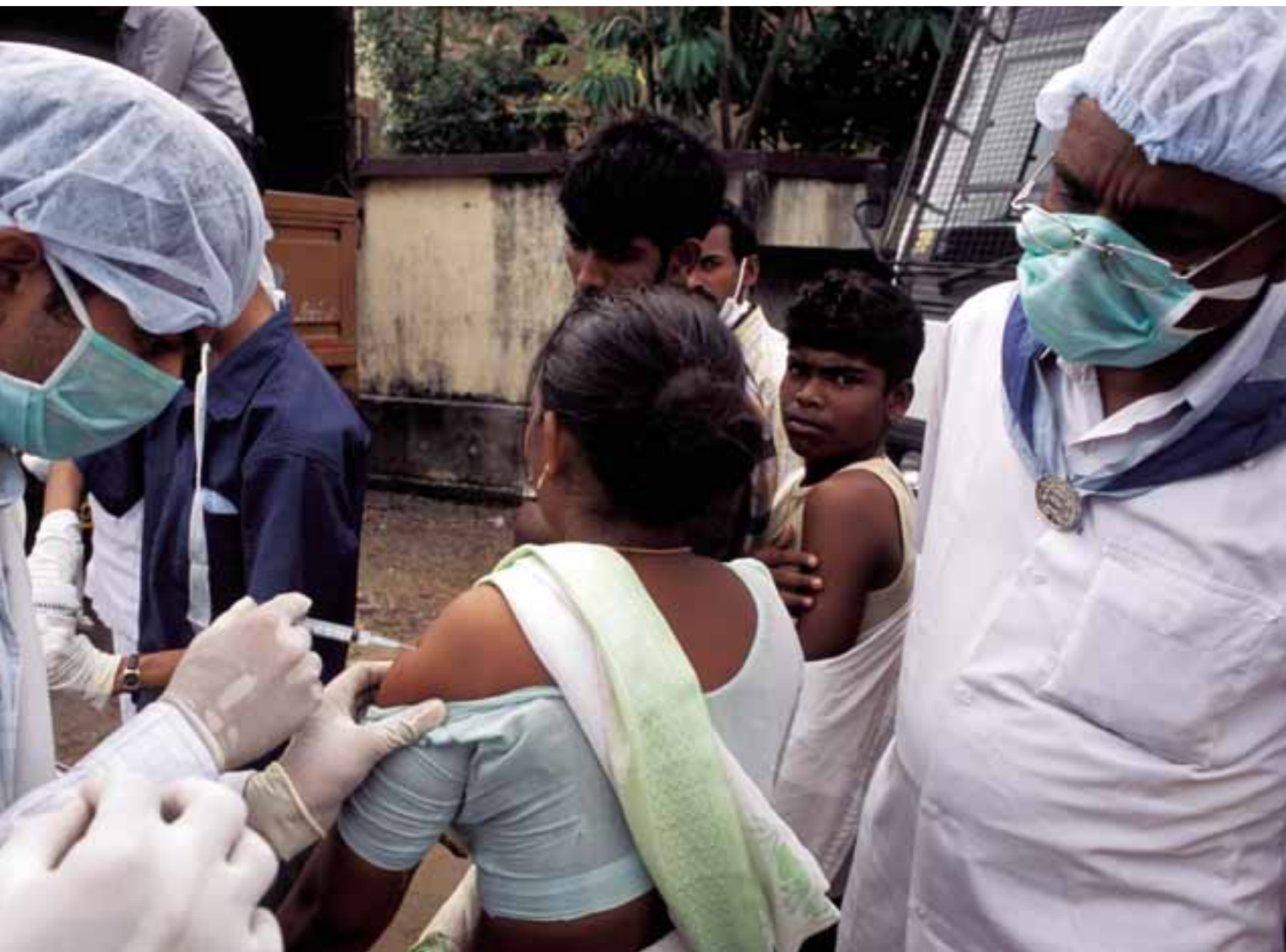
Vaccination campaigns are crucial for preventing disease outbreaks.

In Sri Lanka, Alex Knox, an AusAID program development