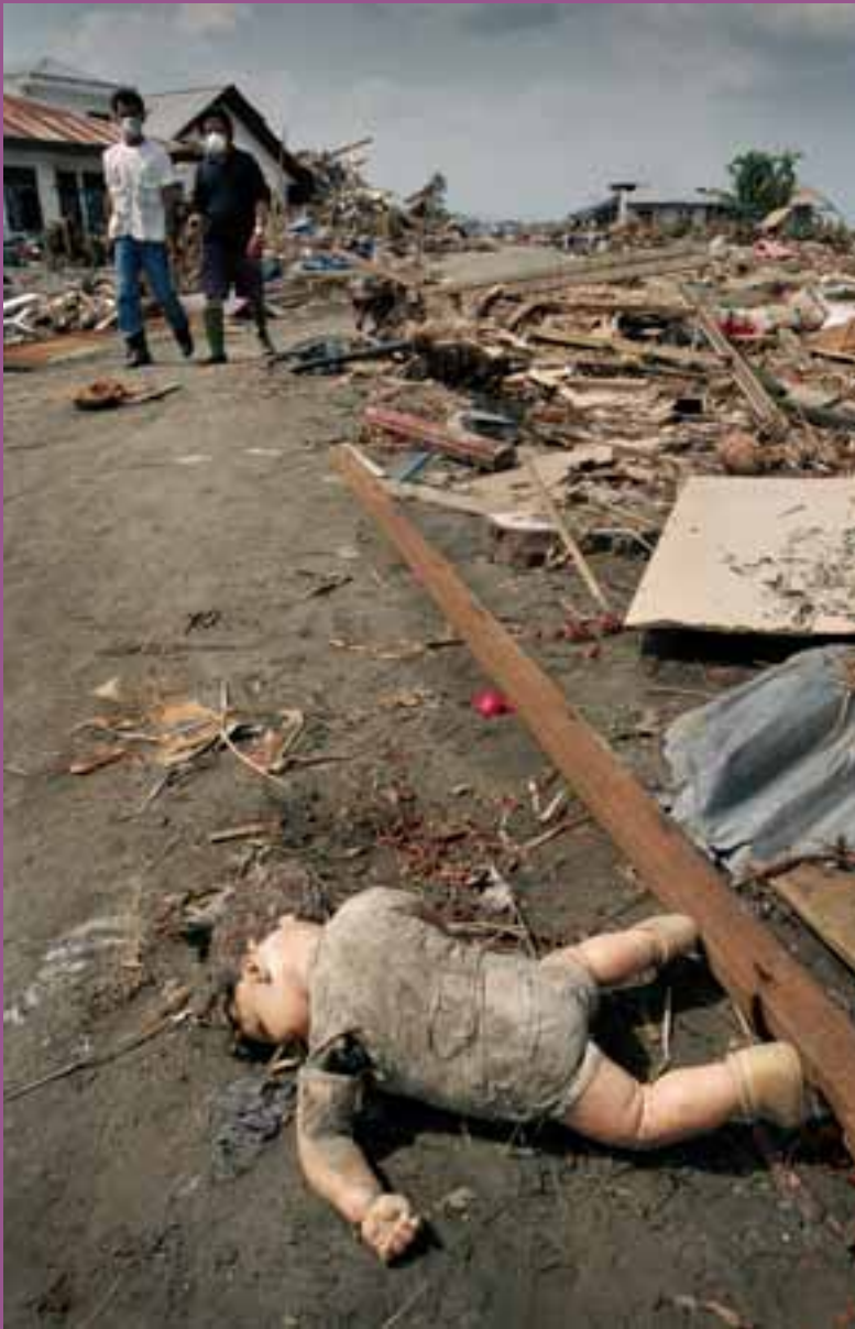
Survivors looking for missing relatives in Ulele district come across a child's doll amid the debris, Banda Aceh, northern Sumatra.

THE EARTHQUAKE IN THE INDIAN OCEAN ON 26 DECEMBER 2004 CAUSED DEATH AND DESTRUCTION ON AN UNPRECEDENTED SCALE. WITHOUT WARNING AND WITH DEVASTATING FEROCITY, A TSUNAMI SMASHED COASTLINES OF 12 COUNTRIES. HUNDREDS OF THOUSANDS OF PEOPLE HAVE DIED, MORE THAN A MILLION ARE HOMELESS AND AN UNKNOWN NUMBER ARE MISSING. FOR SOME COMMUNITIES THERE IS NOTHING LEFT.