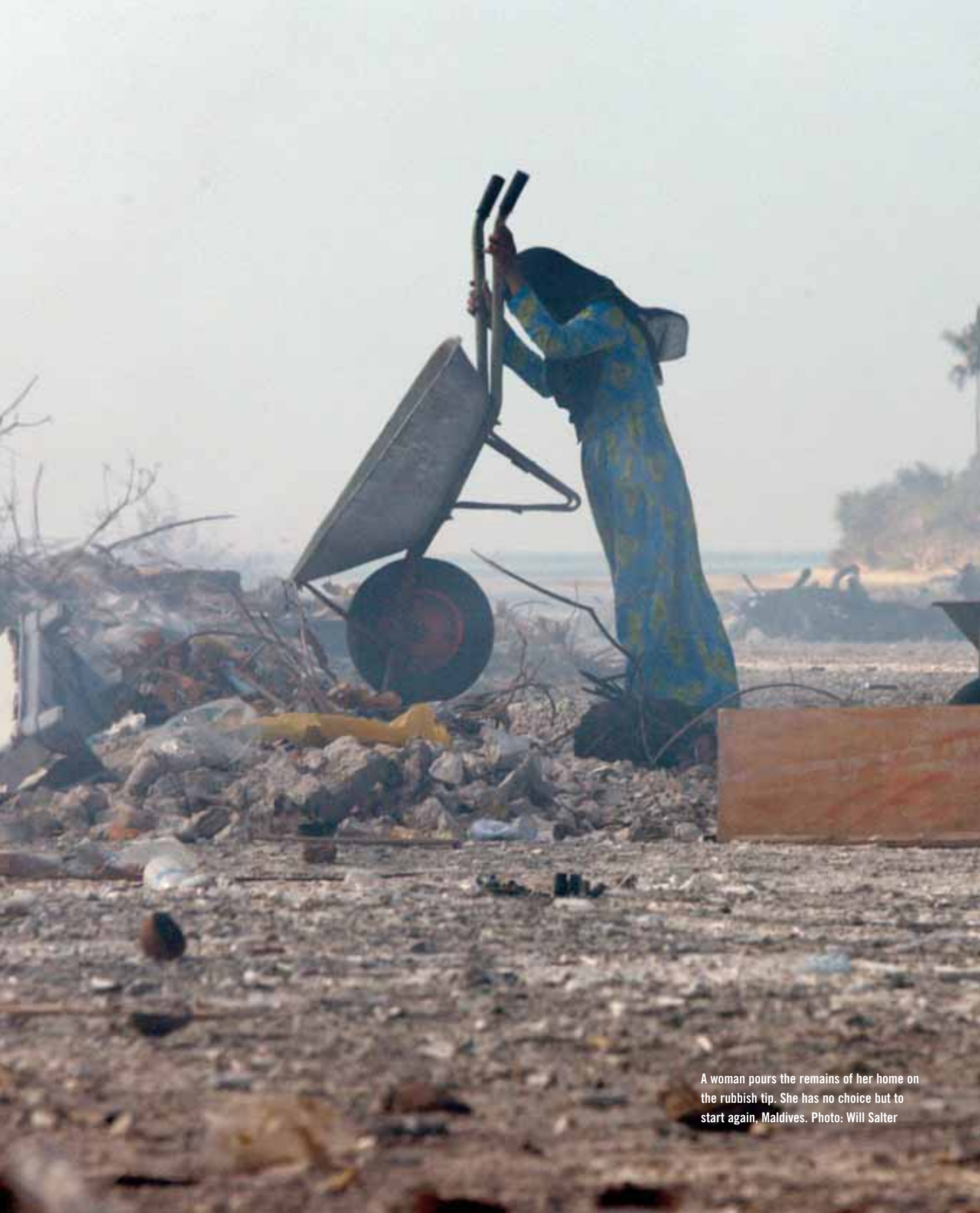
A woman pours the remains of her home on the rubbish tip. She has no choice but to start again, Maldives.