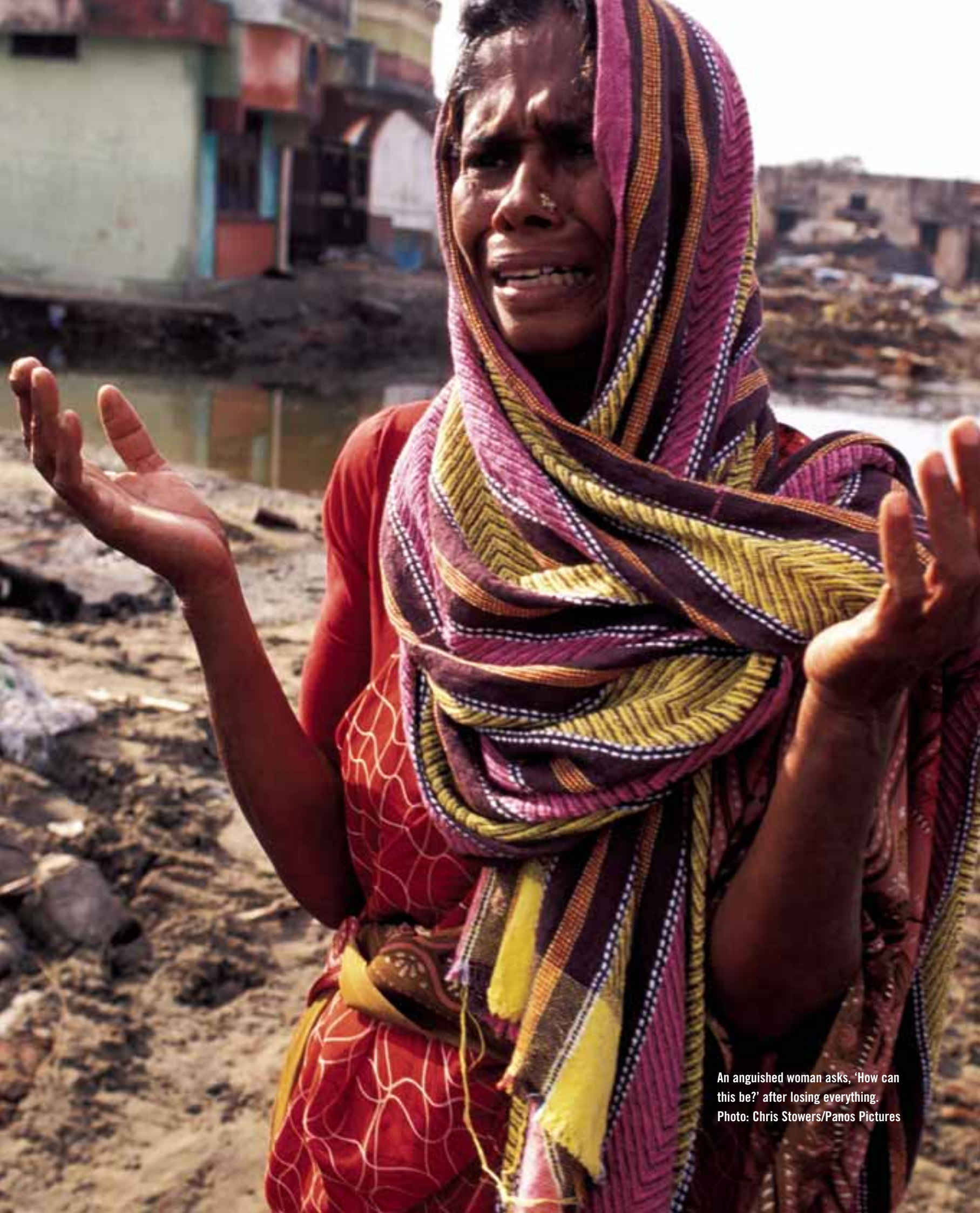
An anguished woman asks, 'How can this be?' after losing everything.