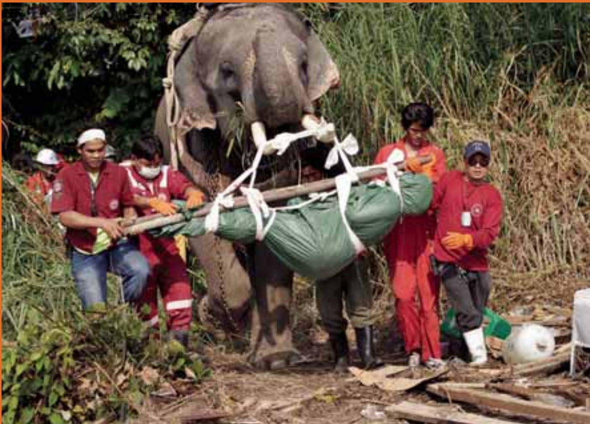
Thai search and rescue teams use elephants to bring out bodies from areas not easily accessible.

THE TREMENDOUS POWER OF THE TSUNAMI CAUSED DESTRUCTION NEVER BEFORE WITNESSED IN RECENT HISTORY.