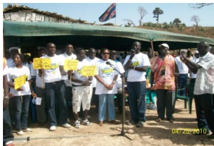
Center: Minister of tourism