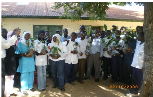
TREE PLANTING-KOTOU SECONDARY

We believe that the word "Poverty" should be removed from our dictionary and that there should no longer be poor countries or poor people on our planet.