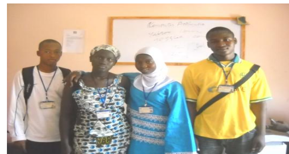
Photo: First Badge of the apprentices in ICT