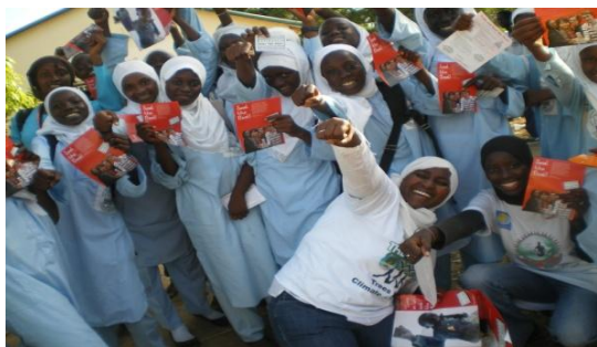
SEAL THE DEAL!!!!