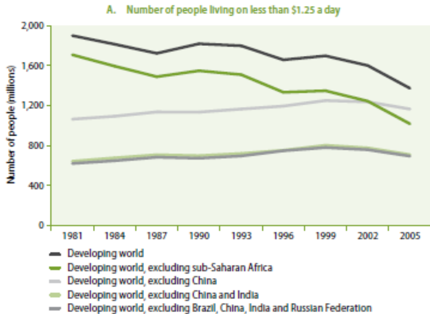
Poverty trends over time, with and without major countries and regions, 1981-2005

Source: World Bank, Development Research Group (2009).