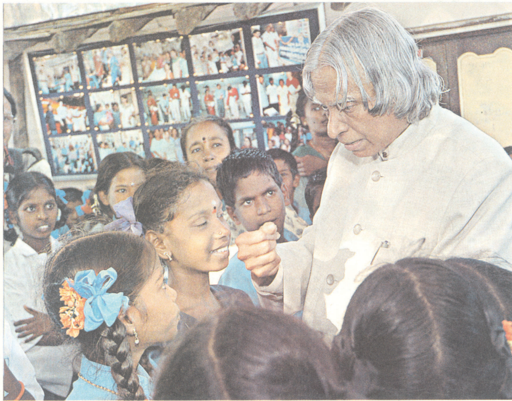
BRINGING HOPE: President A.P.J. Abdul Kalam interacting with tsunami-affected children at Annai Sathya Government Orphanage, Kadampadi, in Nagapattinam district on Thursday.

Suggesting the laying of a "circular road" to promote economic development, he said this