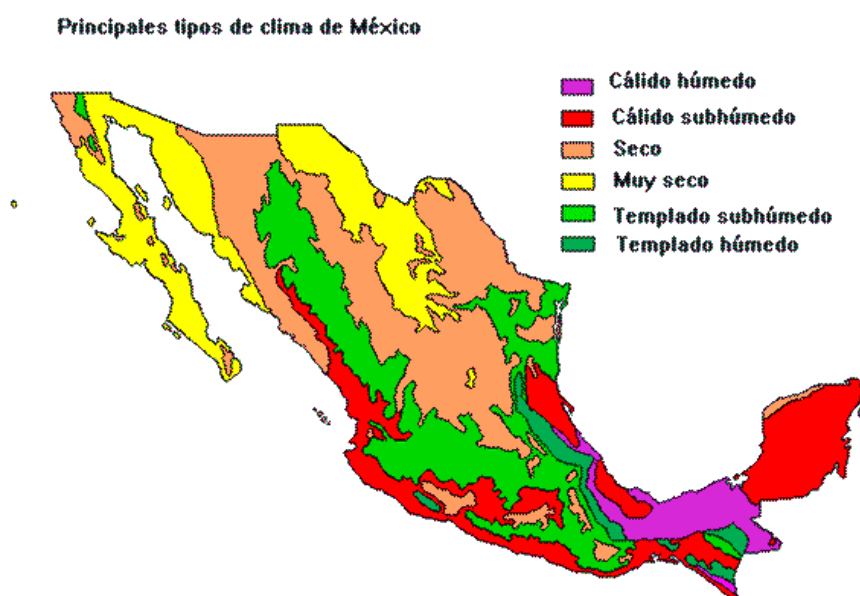
Figura 2. Main kinds of climate in Mexico.

From the center and up to the north of Mexico there are arid and semi-arid climates (Image 2). Given its geographical situation, Mexico has a climate characterized by having a summer rainfall pattern for most of the country in comparison with a relatively dry winter. During the summer the climate is regulated mainly by the activity in the tropical systems such as the position in the Intertropical Convergence Zone, the Mexican monsoon, hurricanes in the Pacific, Gulf of Mexico and the Caribbean and the waves from the East. During winter, the climate is by regulated systems such as the cold fronts.