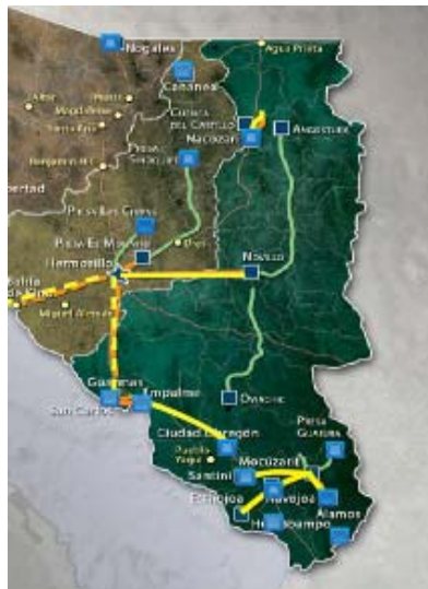
Figura 4 .Works in the Sonora Sí Plan in the Mountains to the south of Sonora State.

Water shortage and the growing demand of the urban centers have promoted water resources rationing programs. One of the objectives in Hermosillo has been to develop an exploitation culture by cutting the supply of this liquid in an alternation system known as tandero 7 . However, water continues to be insufficient without considering extreme drought among the possible scenarios. In general terms the development plans of the hydraulic infrastructure respond to political situations, but are commonly held back due to the lack of agreements and participation. Nowadays the plan Sonora Sí has the objective of balancing the water availability between the southern part of the State (border with Sinaloa) by means of the optimization of the existing hydraulic systems and, particularly, the construction of an aqueduct that is able to transport water from the El Novillo dam (basin of the Yaqui River) to the city of Hermosillo (Image 4).