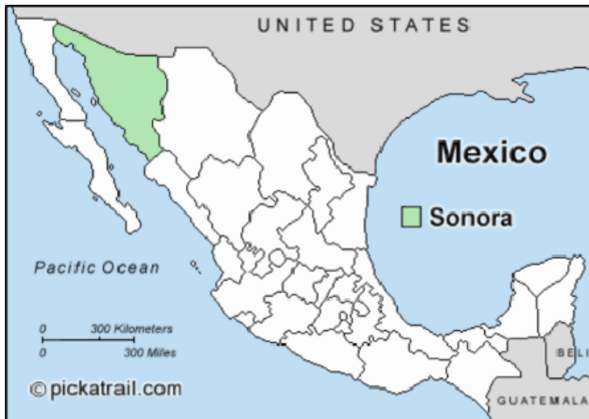
Fig. 3. Location of the Sonora State.

The results of a study performed in Sonora (INE, 2004) show that the regulating mechanism of the winter rainfall is the known phenomenon of El Niño, which results in a trend of higher winter rainfall, while La Niña leads to a drop in the winter precipitation. However, it is not clear what regulates the winter rainfall. Apparently, El Niño does not have a considerable influence over the storms of the Mexican monsoon; this is why the climate predictability is low in this region of Mexico. Most of the difficulty in predicting the seasonal rainfall in Sonora lies in the fact that if a hurricane hits ground in this region, it may cause a rainy year.