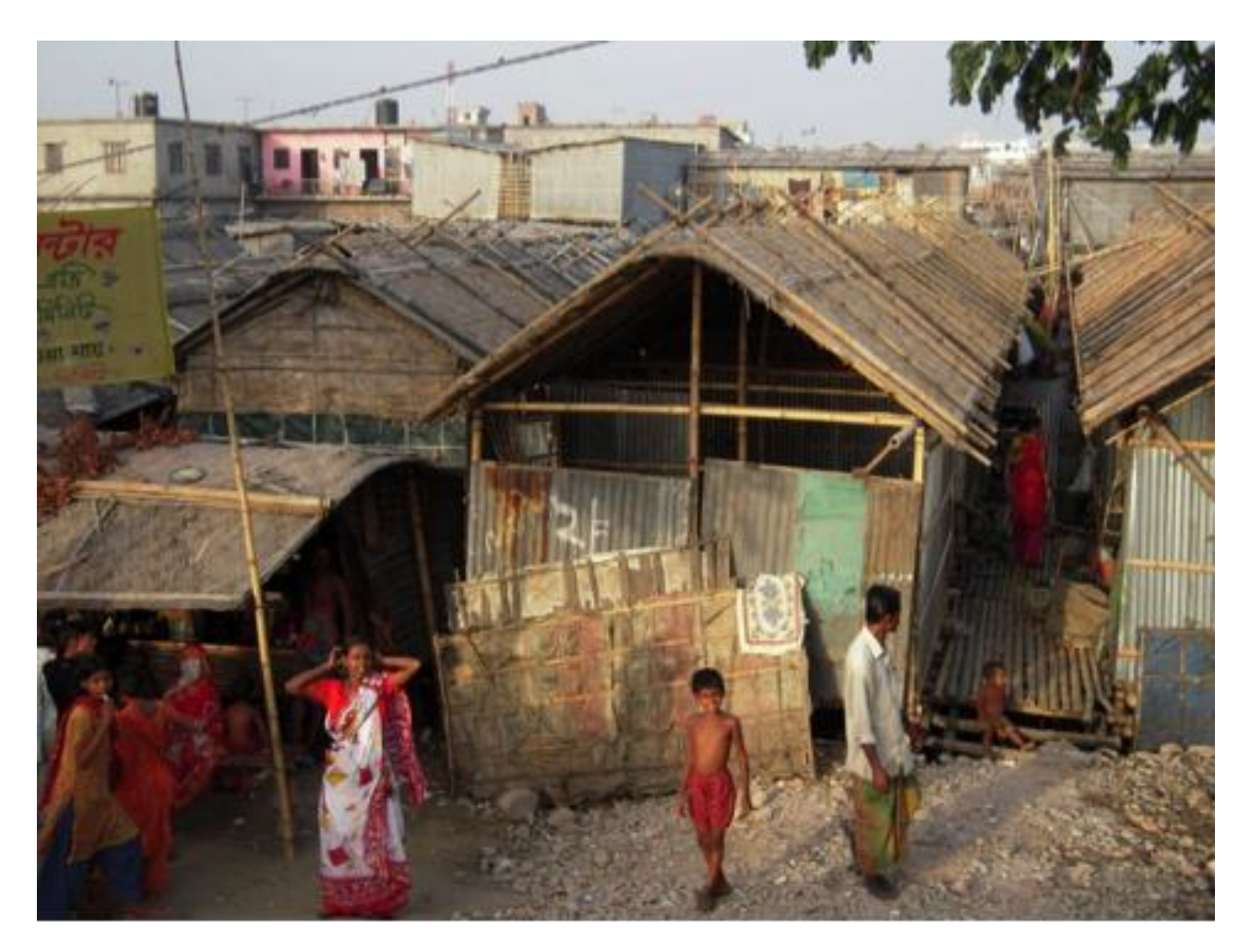
Figure 4: Informal settlement in Mohammedpur, Dhaka does not conform to Bangladesh National Building Code

In Bhuj, Gujurat in 2001, traditional dwellings built with low-strength masonry, as well as modern, reinforced concrete buildings were the major causes of deaths and damages from the earthquake. India had a long-established seismic code, first published in 1962 and periodically updated. However before the 2001 earthquake, even though the code existed, it was left to the discretion of owner, builder or engineer about whether to apply the seismic code provisions, although it was required for public buildings. Thus most of the private buildings, including apartment blocks built by developers, did not conform to the code. After the Bhuj earthquake, compliance with the Code has become mandatory in all areas of highest seismic risk. However, two municipalities, Bhuj and Anjar, which were the worst affected in the 2001 earthquake, decided to simplify the rules for reconstruction, prohibiting all construction higher than two stories. The rational was that they were more accessible for people and could be simplified in terms of procedures (Spence, 2004). In the long term, this kind of standard may not be realistic given required urban densities, however it does illustrate the point that simple and achievable standards may be better at achieving risk reduction than those that are too sophisticated to be implemented properly.