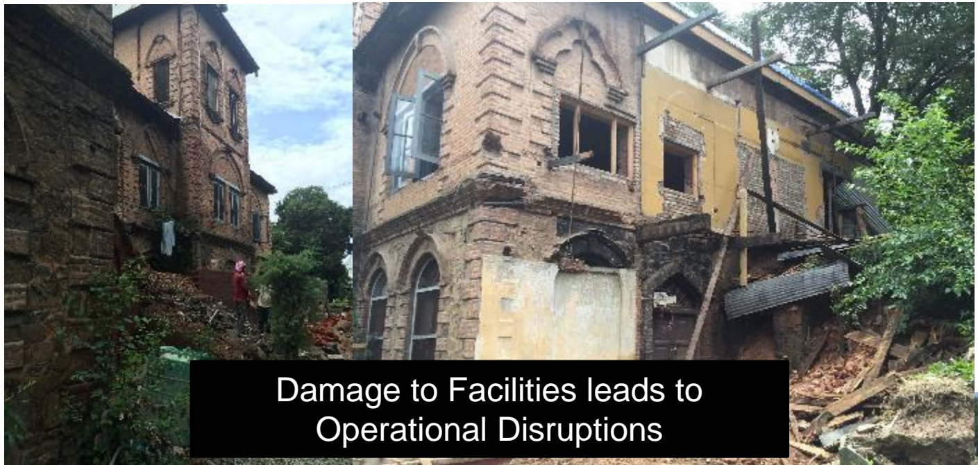
Damage to Facilities leads to Operational Disruptions