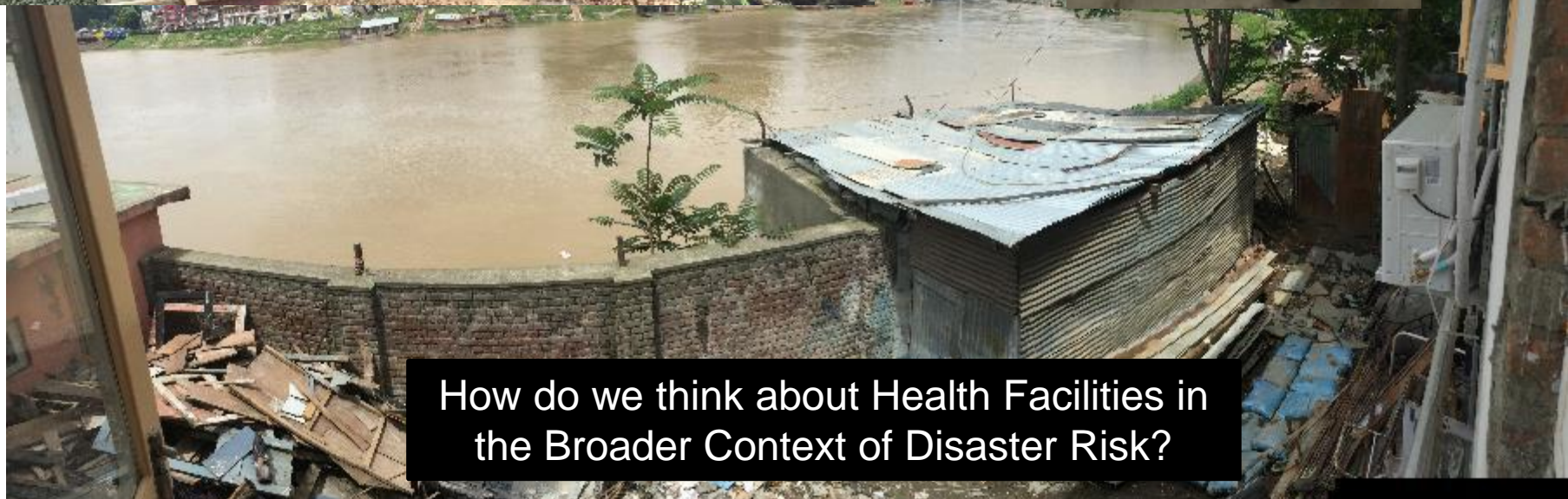
How do we think about Health Facilities in the Broader Context of Disaster Risk?