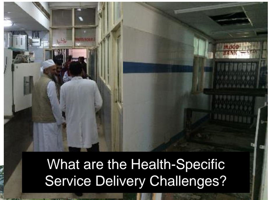
What are the Health-Specific Service Delivery Challenges?