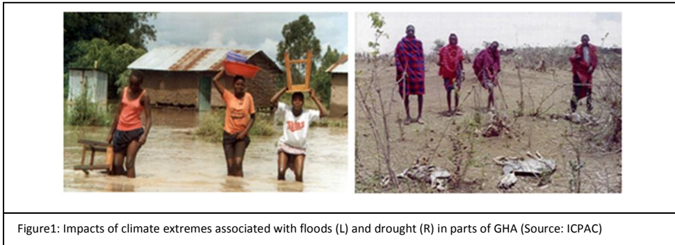
Figure 1: Impacts of climate extremes associated with floods (L) and drought (R) in parts of GHA

Recent Intergovernmental Panel on Climate Change (IPCC) reports [1] indicate that disasters associated with current climate extremes are impacting negatively on livelihoods and socio-economic systems. Extreme weather events such as floods and droughts are negatively impacting on agricultural production and other socio-economic sectors in the Greater Horn of Africa (GHA) region [2]. It is expected that climate change will increase the severity and frequency of these extreme weather events with adverse effects particularly on vulnerable and poor communities.