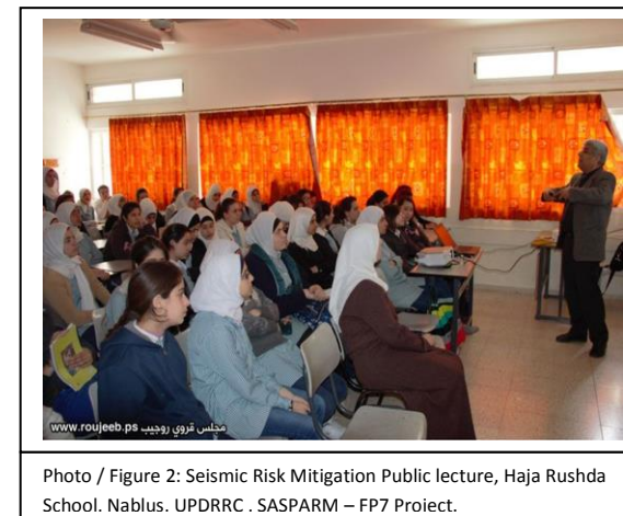
Photo / Figure 2: Seismic Risk Mitigation Public lecture, Haja Rushda School, Nablus, UPDRRC . SASPARM – FP7 Project.