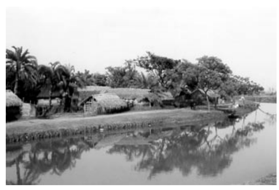
Village of Subarnabad, southwest Bangladesh

The recent environmental changes in Subarnabad have had a number of implications for the poorest villagers. While economic gains from the proliferation of the shrimp industry are very important for the Bangladesh economy, associated environmental and social changes are a growing cause of concern. The increased reliance on a cash economy to provide for basic needs has meant that the poorest villagers have been exposed to new economic, social and cultural stresses. These include a reduction in affordable local food. common resources and livelihood options, and increases in financial expenses, underemployment, family disputes, women-headed households and difficulties educating and marrying off children. In general there has been a decrease in the diversity of livelihood