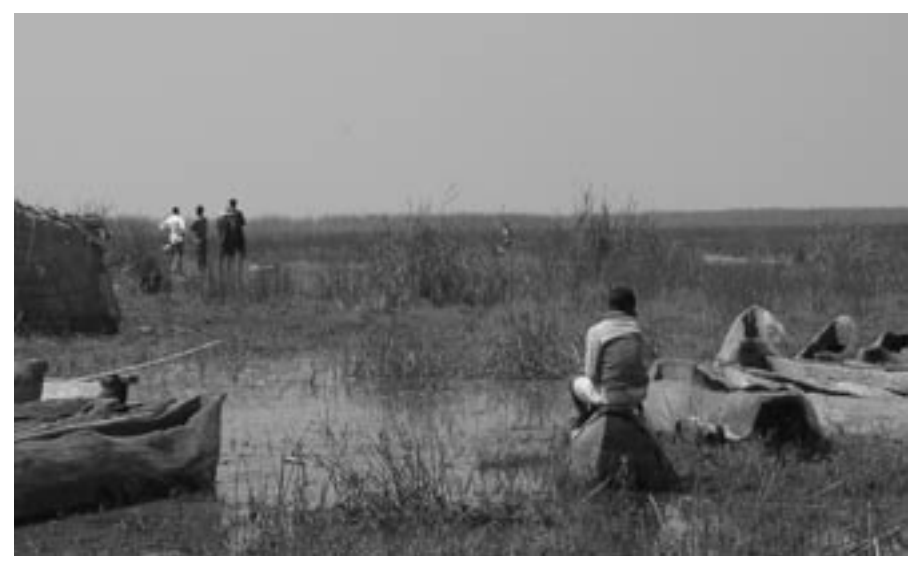
Waiting for the water to return to Lake Chilwa after recent droughts