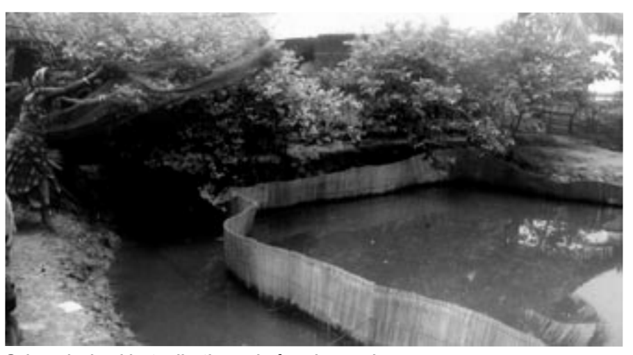
Subarnabad resident collecting crabs from her pond

These adaptation initiatives addressed immediate needs, but did not generally im-